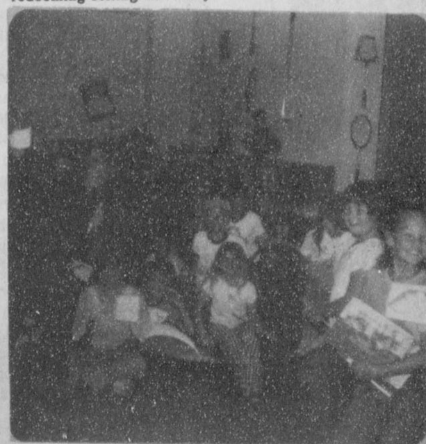
Sports Splash, the Summer Reading Program at the Hansford County Library will soon be over. There will be a swimming

Applicable rates on 1980 wheat at press time are $2.50 loan, $3.75 release, and $4.63 call. Sorghum rates are $2, $2.50 and $2.90 per bu. There has been some Congressional and Administration consideration to raise price supports and release and call rates.