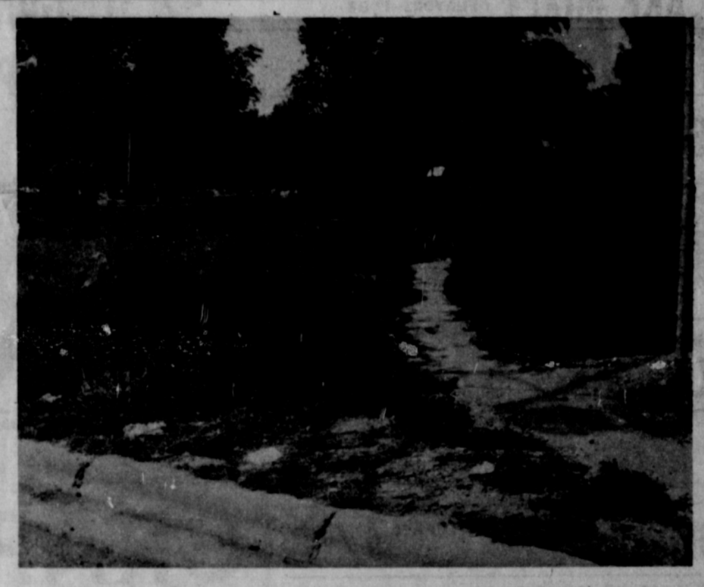
LOST TRAIL -- A path across this park at the swimming pool is almost lost in the tall weeds which have grown up during the rains. Parks are to be mowed soon.

not want it for a city build-ing, if they would object to it being used as a site for a small industry.