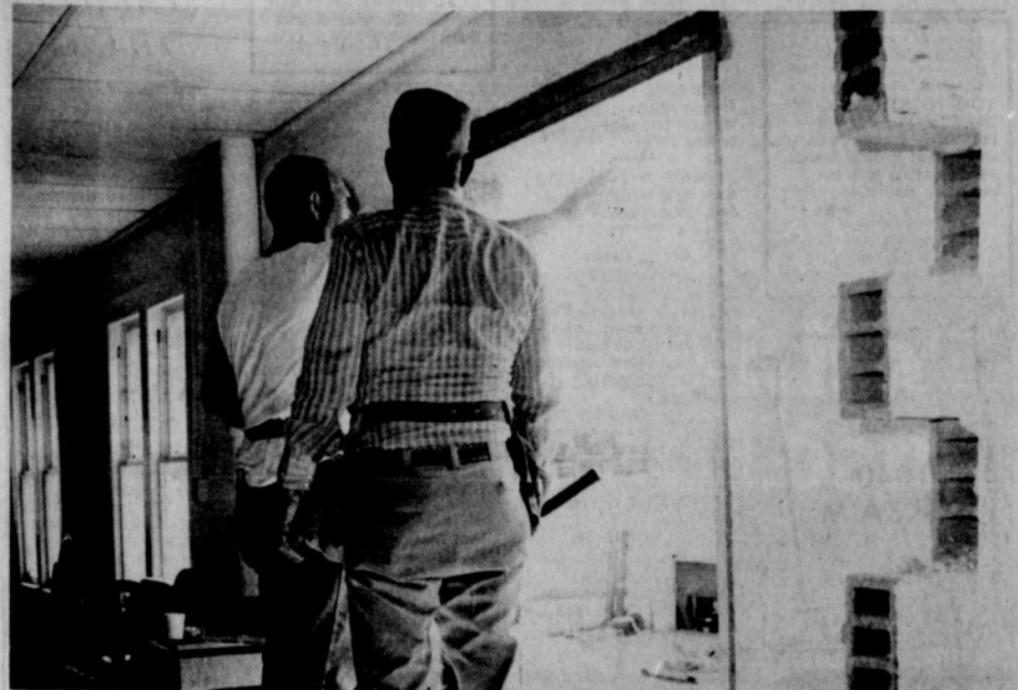
RENOVATION AT HANSFORD LIBRARY-Workmen have been busy this week making preparations to install the elevator at the library. The installation necessitated moving the side door.

In civic work, he has been active in a host of affairs. Recently he has served on the Big Spring Ind. School District School Board, has been President