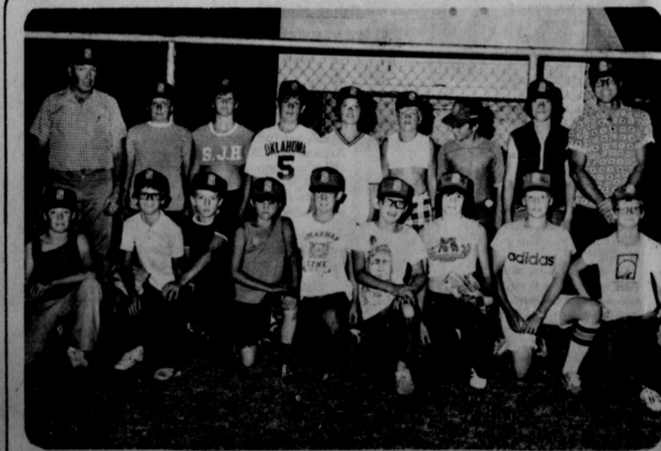
SPEARMAN'S ALL STAR TEAM HEADS FOR BORGER!

Spearman received an unofficial .70 moisture in showers Wednesday and Thursday nights. Temperatures have been moderate this week with high humidity.