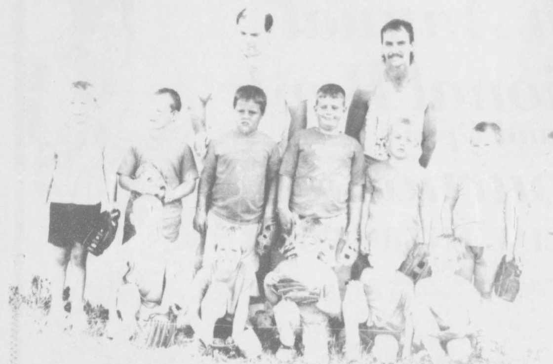
The Boy's T-Ball Orange Team. The kids are all fantastic and want to learn.