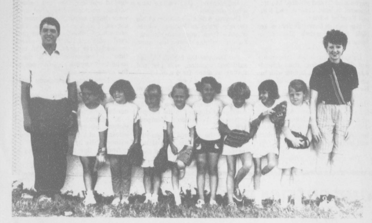
Girl's T-Ball Blue Team had a good time, showed lots of improvement, and were fun to coach.