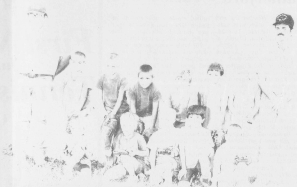
Boy's T-Ball white team had a good time and played some good ball.