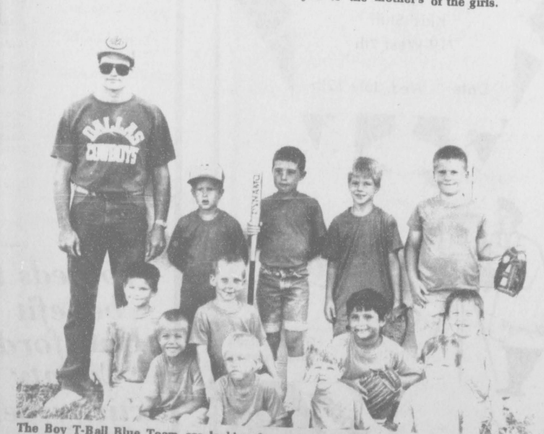
The Boy T-Ball, Blue Team are looking forward to next year.