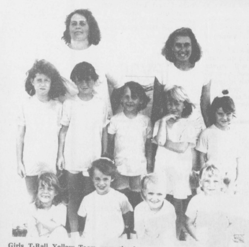
Girls T-Ball Yellow Team says thank you to the mothers of the girls.