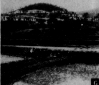
To build a huge 35,000,000 gallon reservoir in Hong Kong, 12 miles of tunnels will have to be bored.