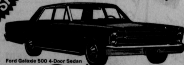
Ford Galaxie 500 4-Door Sedan

Yours now! The deal of the year on the fastest-selling Fords in history! Large selection of big Fords, Fairlanes, Mustangs, Falcons! Plenty of models and colors to choose from. Come in and start saving now!