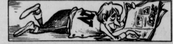
By the time young people reach the ages 15 to 17, over 80 percent of them read a newspaper at least occasionally, the American Newspaper Publishers Assn. reports.

Moose Lodge 2212 BINGO Every Wed. night 7:45 p.m. Must be 21 years old. Everyone Welcome 6-rtn