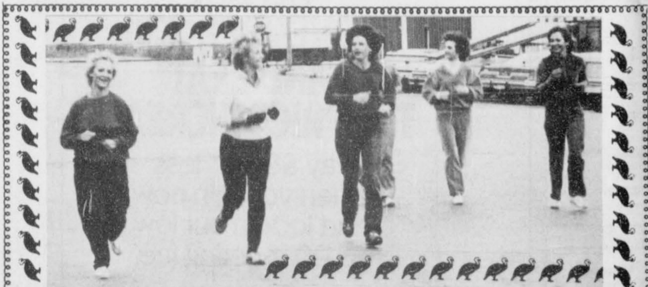
'Get in step girls'-six members of Xi Zeta Upsilon sorority smile and pick up their step as they near the finish line in