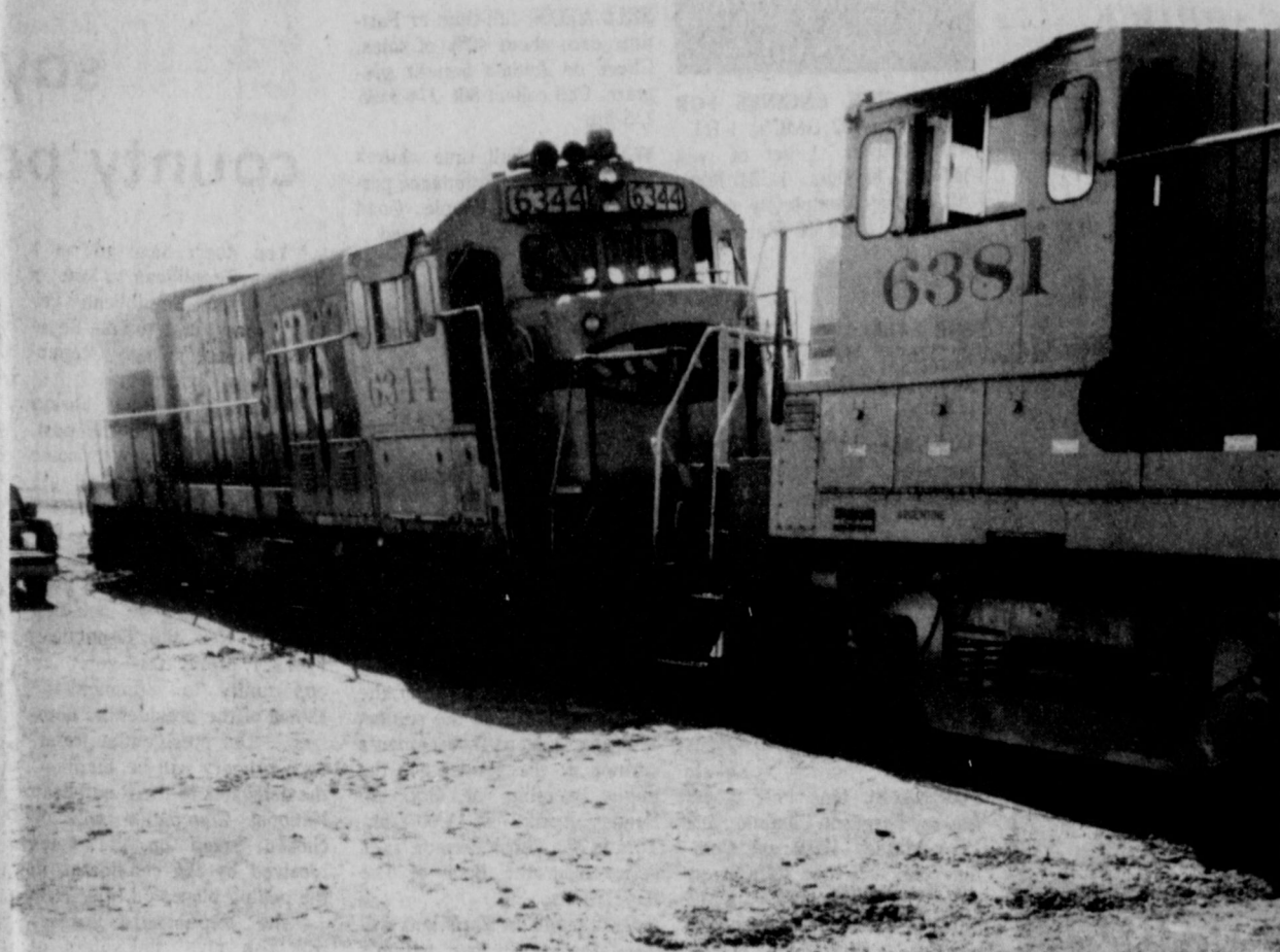
ENGINE NO. 6344 leans precariously to the east after she "struck a mudhole" in the Spearman area Thursday. The talented work crews soon had her back on the track, and if it keeps raining, they plan to put mud - chains on the engines!