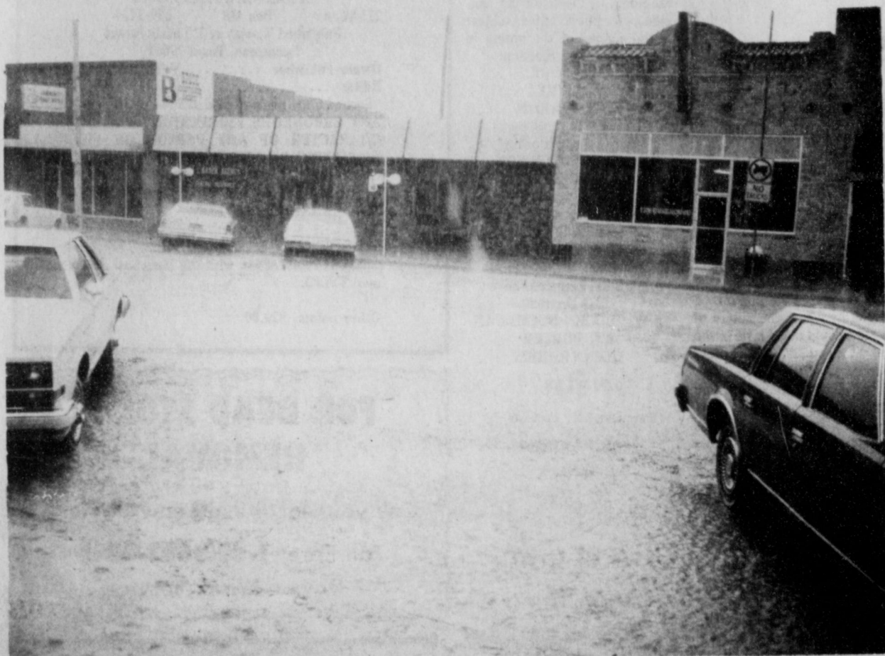
HEAVY RAINS pelted the Spearman-Gruver area Monday, Tuesday, Wednesday, Thursday, and Friday of this week! A total of 2.50 had fallen in the showers by noon Friday, with more rain falling as we go to press! The rain is a blessing, as farmers were just starting to water their wheat!

HANSFORD CO. LIBRARY 120 MAIN SPEARMAN, TEXAS 79081