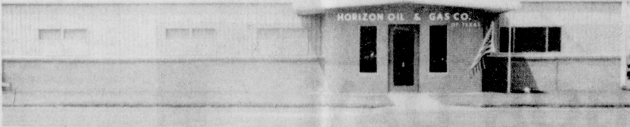
Pictured above is Horizon Oil & Gas Co., Hwy 207 South, August winner in the business division of