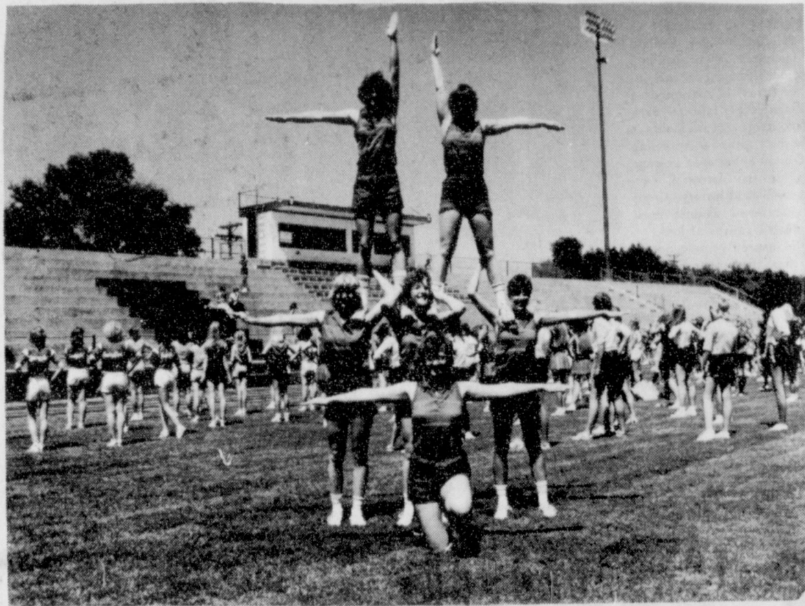
Spearman Football Cheerleaders

The ACT Assessment Program is a major service of The American College Testing Program, which has national headquarters in Iowa City, Iowa.