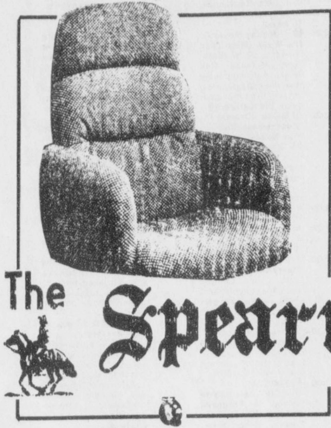
#2601 List $278 00

Keep The Cost At A Minimum With Vanguard