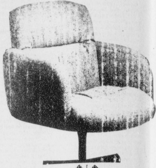
List $247 80

Stocked in Rust, Brown, Cream Velour & Tweed.