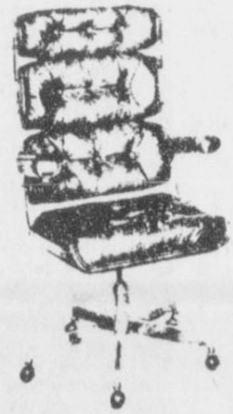
#1300 List $511 10