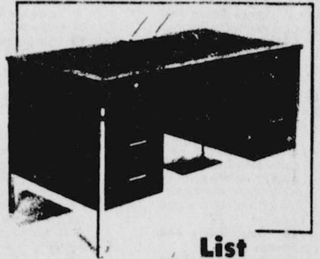
PD54 24x54 List $267 65