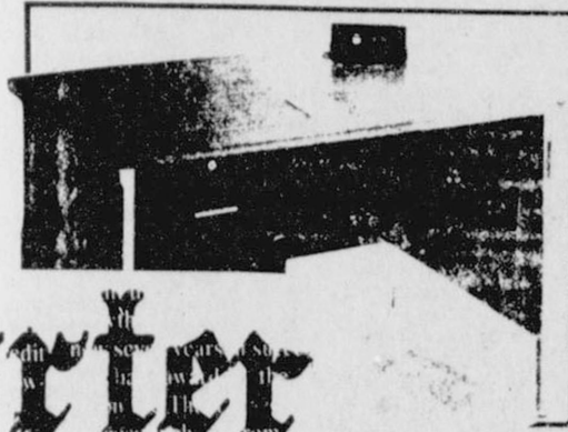
PD40 24x40 List $152 90

Stocked in Rust, Brown, Cream Velour & Tweed.