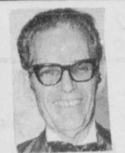
FAT CAN BE FATAL

overweight. 45% of women in their 50's are overweight. You are what you eat. Poor eating habits cause obesity, which is not only embarrassing, but dangerous. Obesity may cause high cholesterol and high blood pressure--major causes of heart attack. A proper diet can save you life. Obesity is a national epidemic. Here are some "FAT FACTS" to show what I mean: Americans spend $10 billion a year trying to control their weight. 3 out of every 10 Americans are at least 20% overweight. (A person who is more than 15% overweight is obese.) 10% of men in their 20's are overweight. 35% of men in their 50's are overweight. 25% of women in their 20's are Excess fats put a strain on your body. The heart and circulatory system suffer the most from excess fats. High cholesterol levels may be accompanied by high blood pressure. In combination, these risk factors may set the stage for heart attack earlier in life. This information has been brought to you as a public service by John R. Collard, Jr., your one stop answer to complete business and personal insurance protection. Life, home, auto, group insurance, and profit-sharing plans. See John R. Collard, Jr., 405 Davis St., Telephone 659-2501.