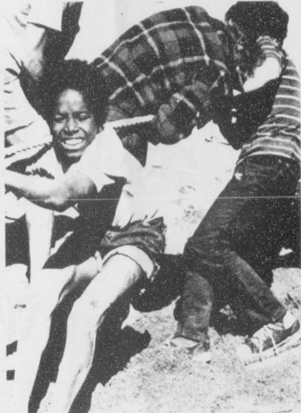
Pulling together — yet challenging themselves — is part of the experience more than 13,000 youth have shared at the R.M. Pyles Boys Camp.