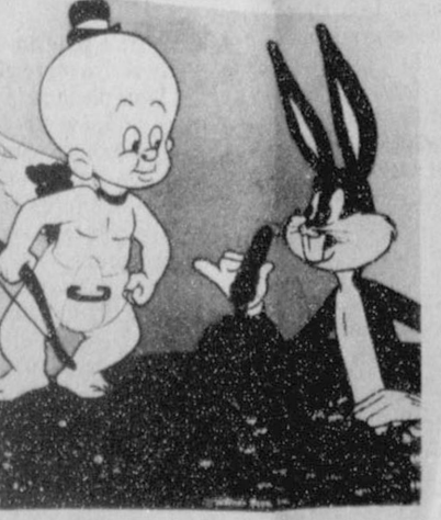
Elmer Fudd plays Cupid on an exasperatingly uncooperative Bugs Bunny, in BUGS BUNNY'S VALENTINE, animated special to be rebroadcast Wednesday, February 4 on CBS-TV.

Merv Gordon - Owner The very latest in men's hair cutting is featured at MERV'S BARBER SHOP in Perryton located at 13 SE 3rd Ave., phone 435-2643. The modern barber in the old fashioned tradition! This is one shop where that famous old-time atmosphere can still be found with friendly conversation, good reading materials AND the ultimate in quality hair cutting. Make an appointment or just walk-in...you'll become a regular customer after just one visit! This well known shop features all of the traditional services such as hot towel shaves, facial massage and skilled, professional hair cutting. You'll like the nostalgic atmosphere as much as you like the outstanding services offered. Drop in today and find out what PROFESSIONAL barbering really means! The editors of this 1981 Business Review are very pleased to be able to list an outstanding shop as our recommendation for quality barbering in the area.