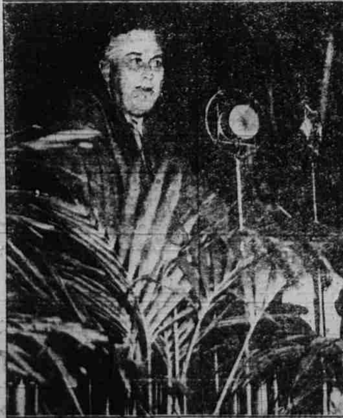
Governor Roosevelt delivered the first address of his second major campaign tour in Rochester, N. Y. He is shown speaking in the "sheeter concert" hall.