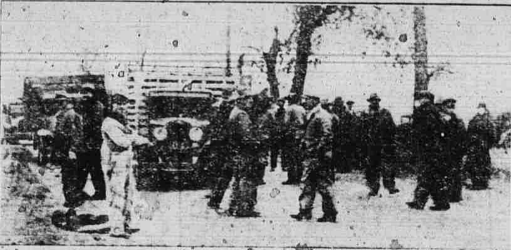
Until the Minnesota state highway patrol cleared roads near St. Paul, several highways were blocked by "striking" farmers who refused to allow produce trucks to deliver their loads. This picture shows a typical traffic snarl before patrolmen cleared the roads.