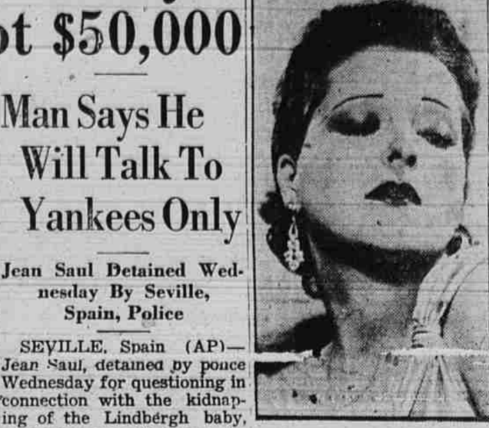
A more sophisticated Clara Bow with a new coiffure and a new manner has taken the place of the fiery redhead of other days...