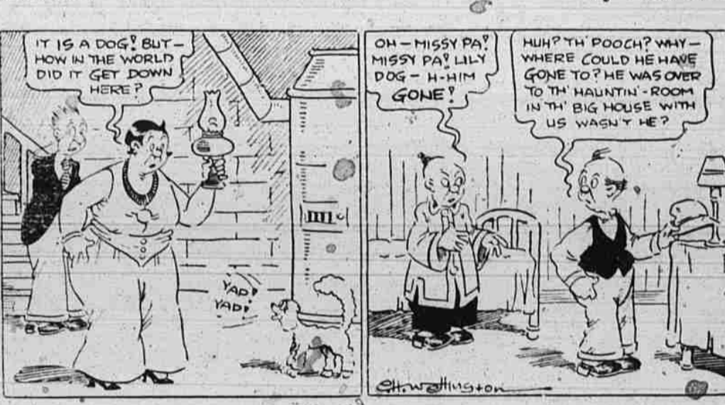
Change Of Charge