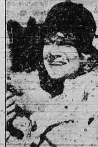
Eva Tanguay, stage star of years ago, is winning her fight for health after a long illness. She is now able to take walks from her Hollywood home with her pet dog.