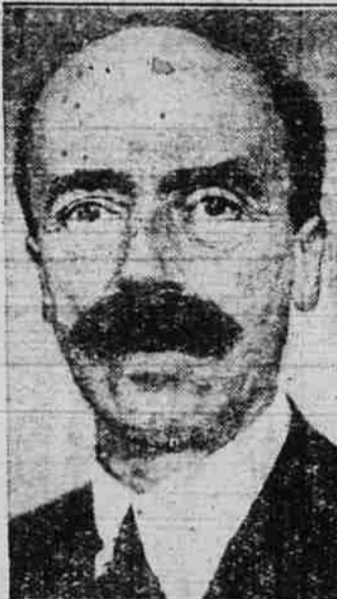
Police saved former Premier Stephen Bethlen of Hungary from an assassin's dagger, wielded by a secretary to a former minister in a Budapest court. Bethlen was unhurt.