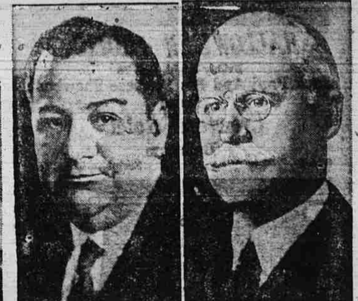
W. Warren Barbour (left) is seeking election to the United States senate from New Jersey on the republican ticket. His democratic rival is Percy H. Stewart.