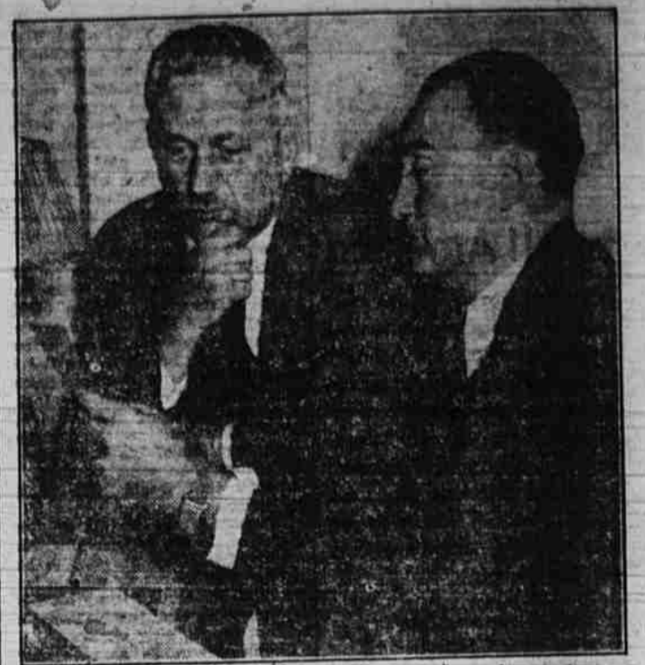
Attorneys in Chicago are making preparations for the extradition of Samuel Insull, who was indicted in Chicago on charges of larceny and embezzlement. After getting a complete legal record of the case with the cooperation of the state department, the attorneys expect to go to Greece.