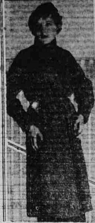
The Russian influence is seen in winter fashions. Leila Hyams wears this Cossack coat with the cartridge pockets. The turban is of astrakhan fur.