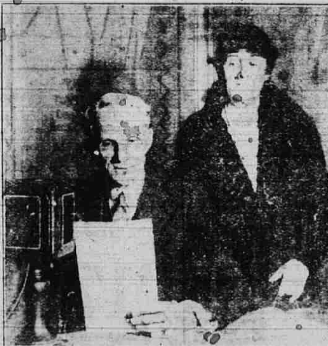
Henry Ford is shown as he spoke from Detroit, urging the reelection of President Hoover as "the best man for the job." Mrs. Ford is standing beside him.