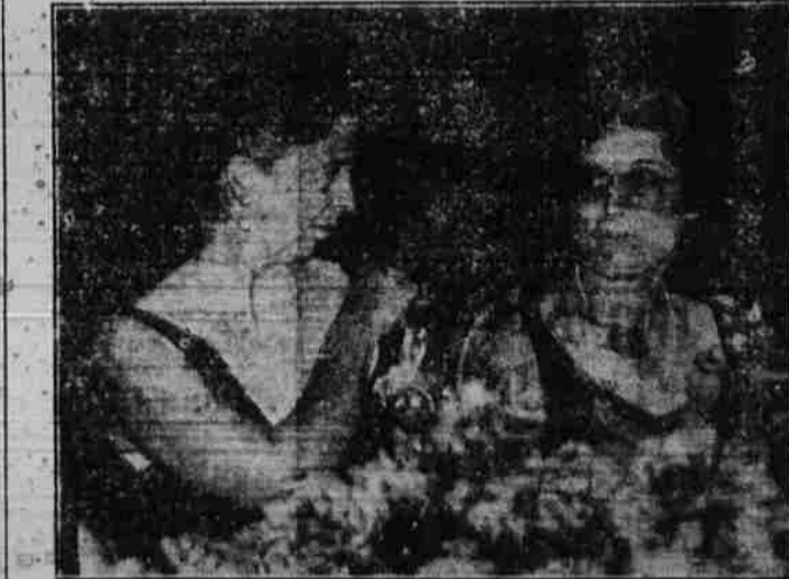
Mrs. Franklin D. Roosevelt (left), wife of the democratic presidential candidate, and Mrs. Herbert Lehman, whose husband is the democratic candidate to succeed Roosevelt as governor of New York, are shown at a reception of the King's county women's forum in New York.