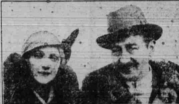
The separation of Adolphe Menjou, screen star, and his wife, known in motion pictures as Kathryn Carver, was announced by her attorney. The attorney said Miss Carver will file suit for divorce shortly. They were married in Paris in May 1925.