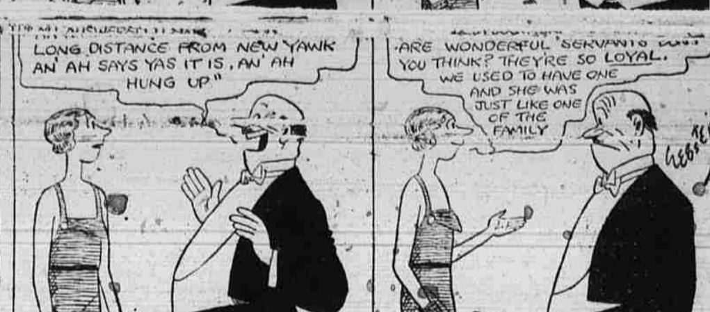
Lost And Found