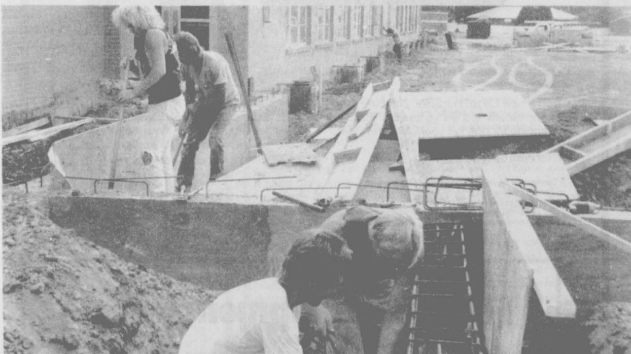
Work is still going steady at the Spearman school. These men are putting in steel supports that will be the beginning of the walls for the additional classrooms. The men couldn't take the time to give