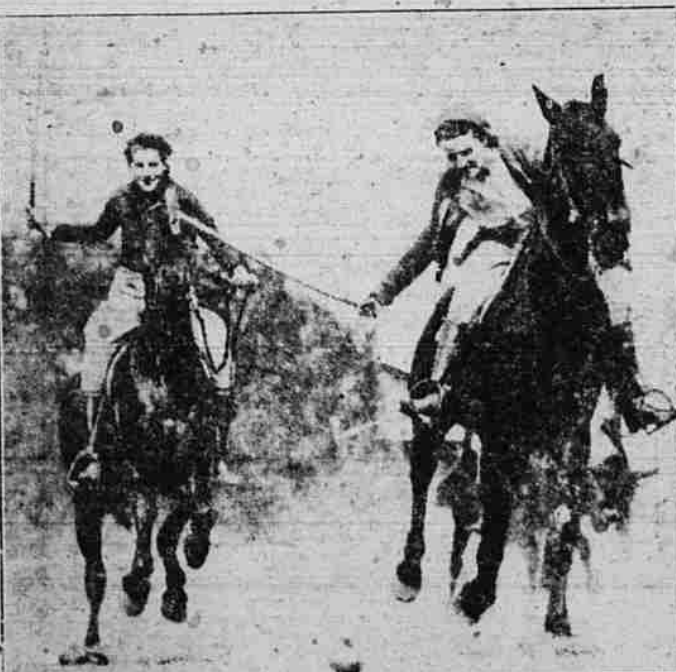
Co-eds at the state college, San Diego, Cal., have formed a polo team which plays several days a week after classes. After an hour of such hard riding as is shown in this shot, the equestriennes are ready for a late afternoon "spot of tea."