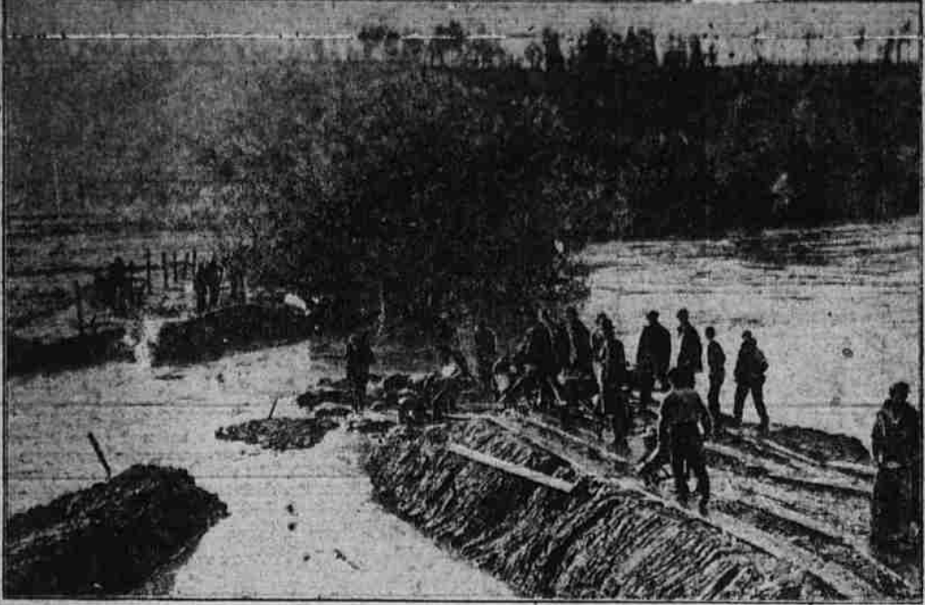
This scene on the Green river near Seattle, Wash., where more than 50 men worked day and night to keep the stream from getting completely out of control was typical of conditions in western Washington state as heavy fall rains and melting mountain snows sent all streams to flood stage.

RIVERS OUT OF BANKS IN WESTERN WASHINGTON FIVE DIE IN TENNESSEE CRASH CRIME DETECTION LABORATORY IS 'HALL OF DEATH'