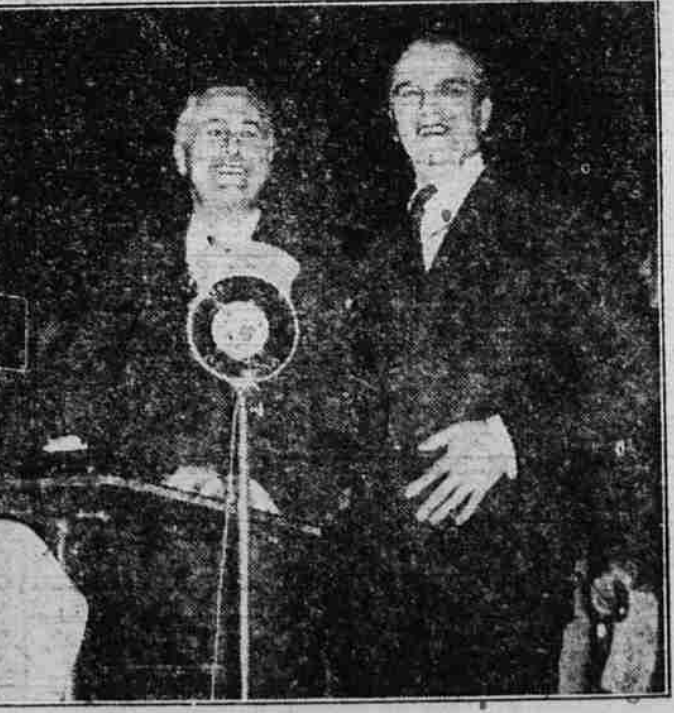
Governor Roosevelt and Owen D. Young were speakers at a rally in the Metropolitan opera house, New York, sponsored by the Republicans for Roosevelt club. The two are shown together on the speakers' platform.