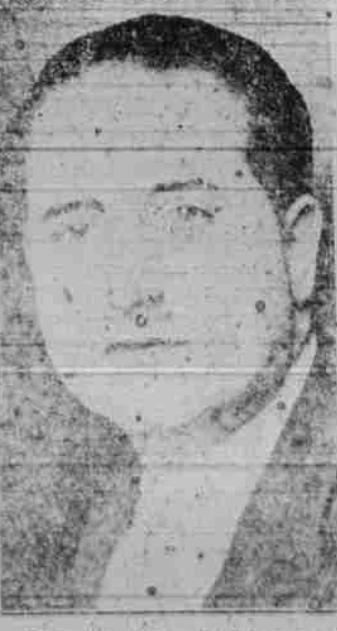
Formation of an economic platform among France, Germany and Great Britain designed to rehabilitate Europe, was announced by Raymond Patenotre, the American-born French under-secretary for national economy.