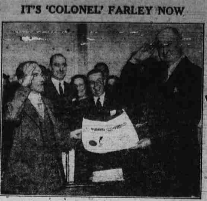
James A. Farley, chairman of the democratic national committee, is now of equal rank to Louis McHenry Howe, personal secretary to President-elect Roosevelt. Howe (left), who was made a colonel on the staff of Governor LaFolton of Kentucky, invested Farley with the title of colonel on the staff of Gov. "Alfalfa Bill" Murray of Oklahoma at democratic headquarters in New York.