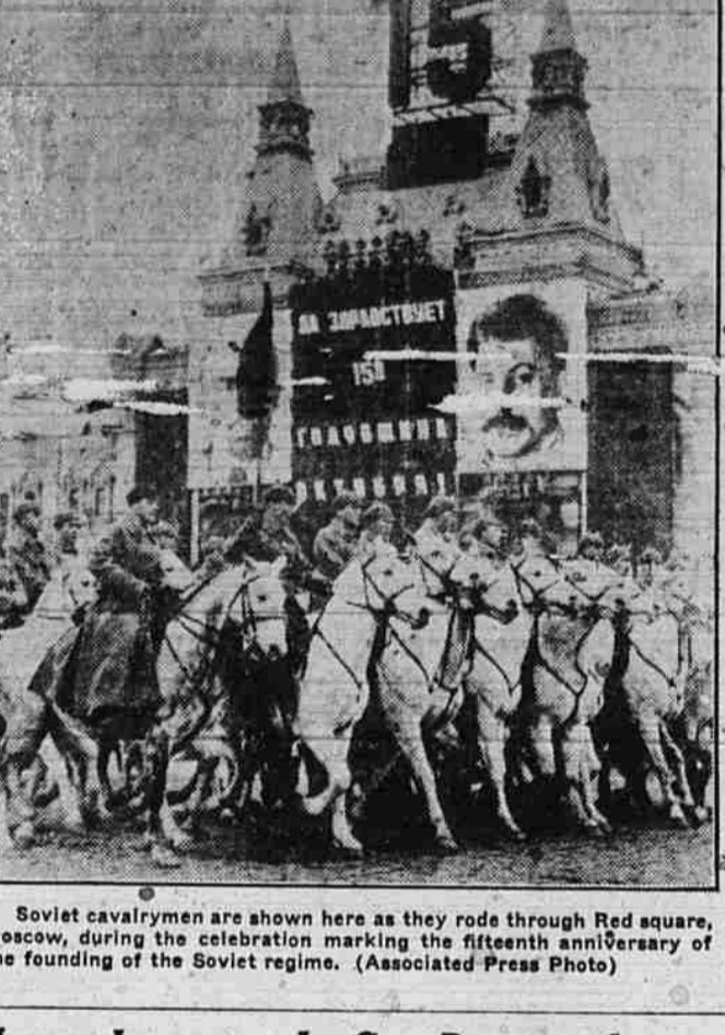
Soviet cavalrymen are shown here as they rode through Red square, Moscow, during the celebration marking the fifteenth anniversary of the founding of the Soviet regime.

Heavy Increase In Gas Reported From Harrison Et Al No. 1 Addis Wildcat Oil Test In Ector County A continued increase in gas in L. C. Harrison and others' No. 1 F. V. Addis estate, Ector county wildcat, to an amount estimated as high as 10 million cubic feet daily as drilling progressed Saturday to 3,531 feet, heightened the possibility of the opening of the first major pool in West Texas in two years. No oil had been struck but the test is running highly structurally.