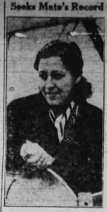
Amy Johnson, Britain's famous woman pilot, attempted to better the record of her husband, J. A. Mollison, in a flight from London to Cape Town.