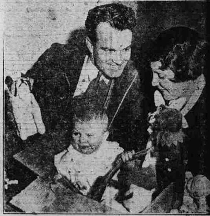
Sue Carol, motion picture actress, held a "baby audition" in her home in New York. She wants a baby for adoption, but not for herself. She is selecting it for an unnamed friend. She is shown here with her husband, Nick Stuart and one of the "eligibles" brought to her home. Stuart and Miss Carol have a 4-month-old baby of their own.