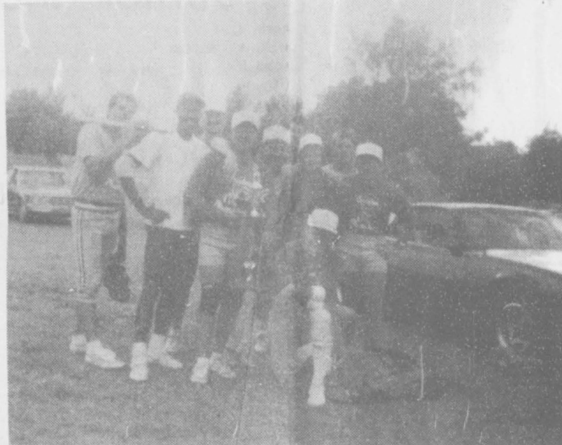
3rd place Snider Plumbing, Amarillo