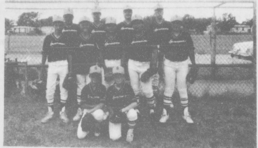
These Spearman ballplayers participated in a Summer Junior Babe Ruth program. Other teams in the program were Booker, Canadian, Follett, Perryton and Beaver, Okla.