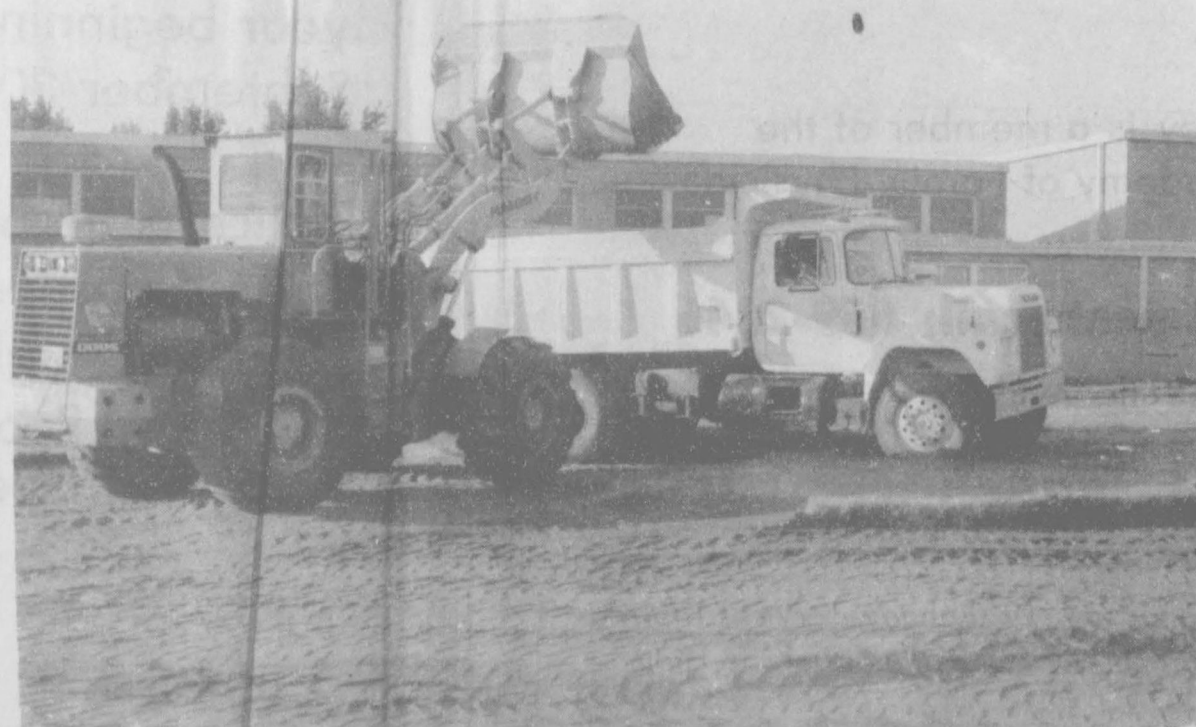
This is a sample of what you'll be seeing while driving by the elementary school. Construction is underway with plans of adding classrooms here where they have cleared the grass to make way for it.