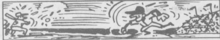
A relief pitcher is allowed eight warm-up pitches when he comes into a baseball game.

The newspaper will keep you informed of the progress at the school and plan to have some kind of map that will show just what improvements are to be made.