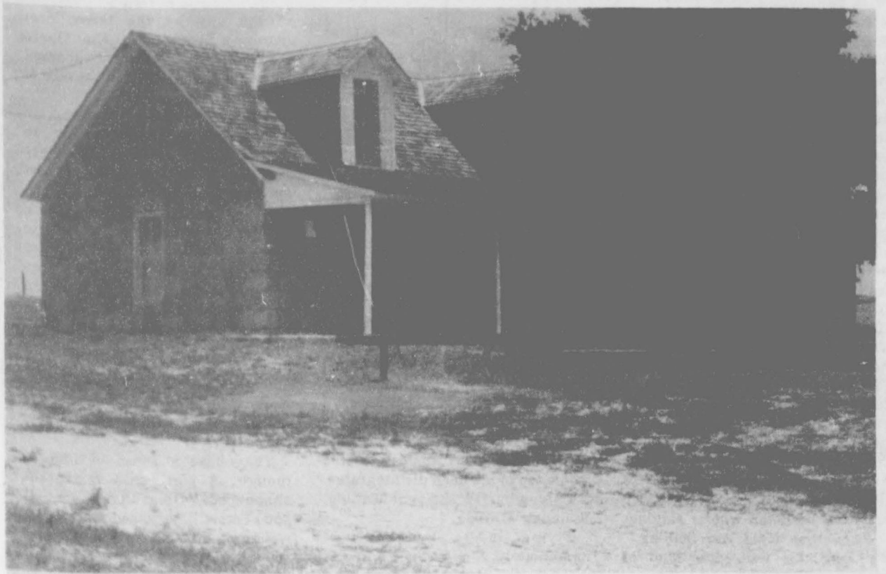
One of the first ranch houses in the area, Turkey Track ranch house [built in late 1880's] still stands.

The family of Katherine Coble Whittenburg, the only child of Tom Coble still owns the ranch. Wes Whitaker leases the ranch today and has done extensive restoration work to the house.