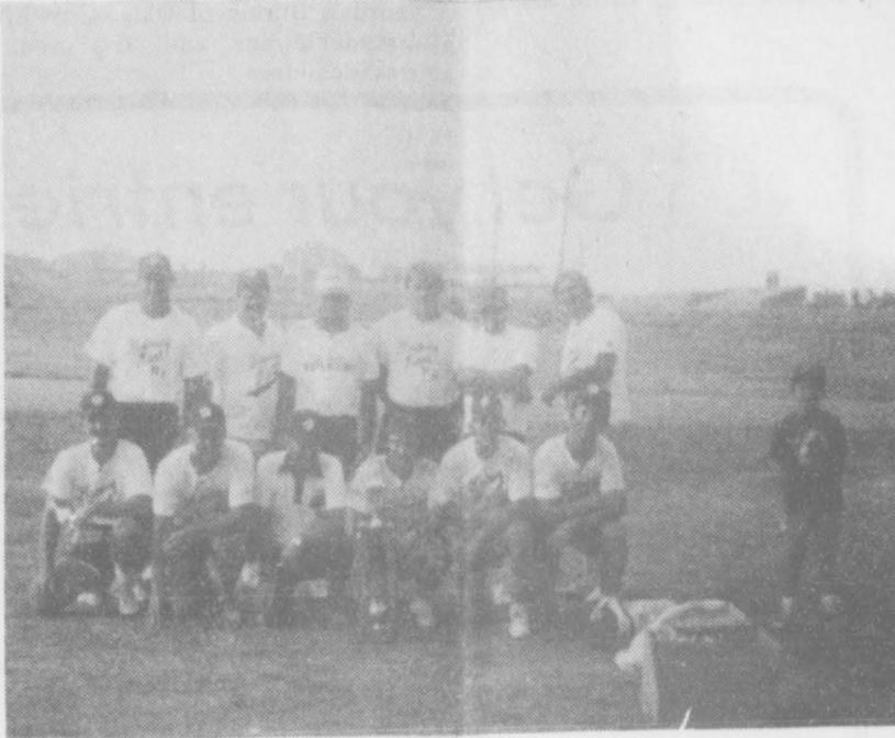
2nd place Harvey Mart 2, Pampa