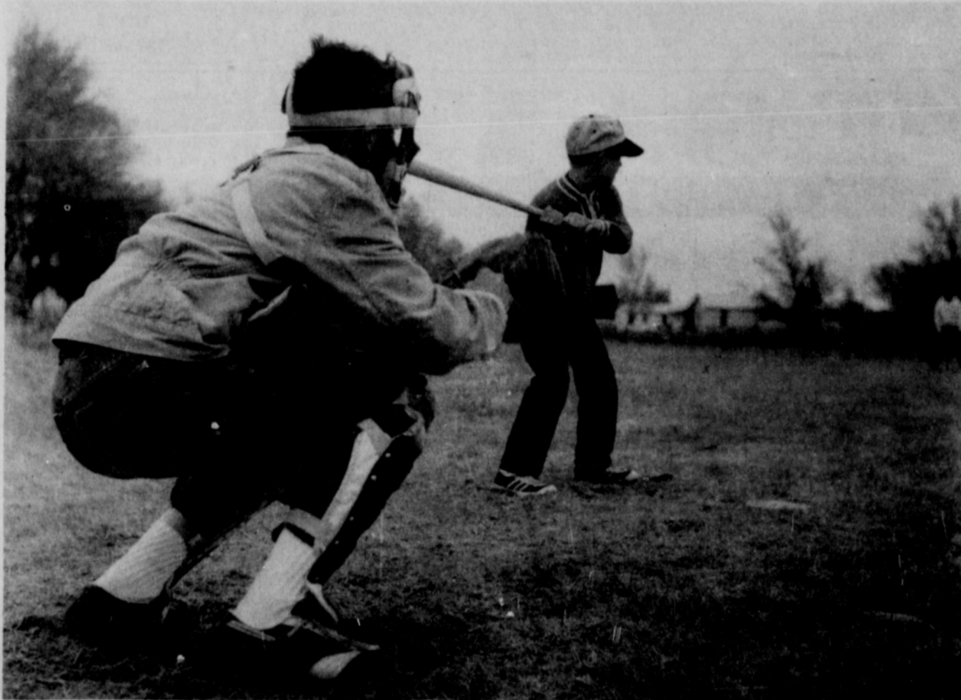
BATTER UP - Batting practice is underway by Spearman's Little League teams in preparation for the coming baseball season. Above are pictured members of the Astros. See inside for this seasons Little League Schedule.