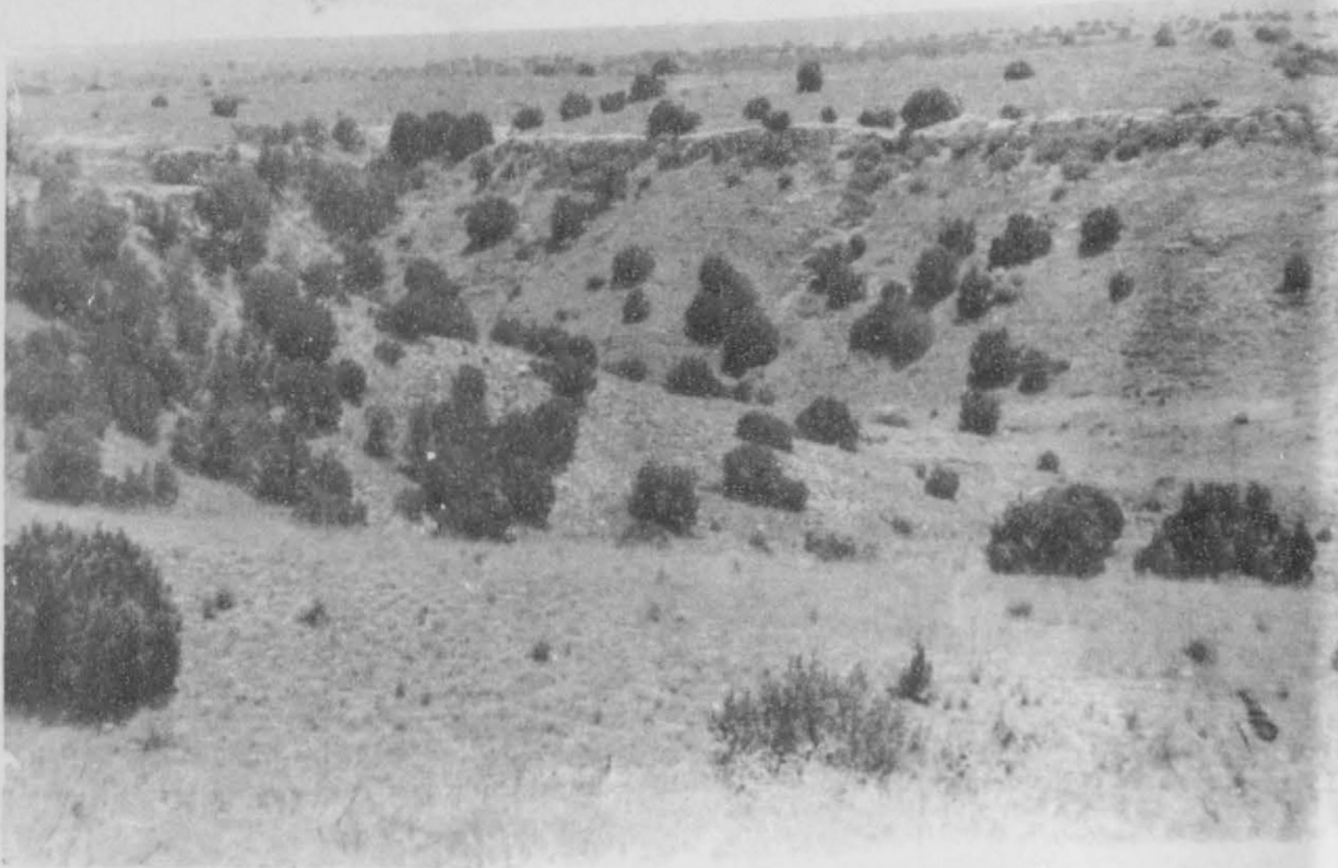
THE HORSE CREEK site is pictured above. It will drain into the Palo Duro, about 1/4 miles South of the dam site, giving the area two good water sheds for the lake.