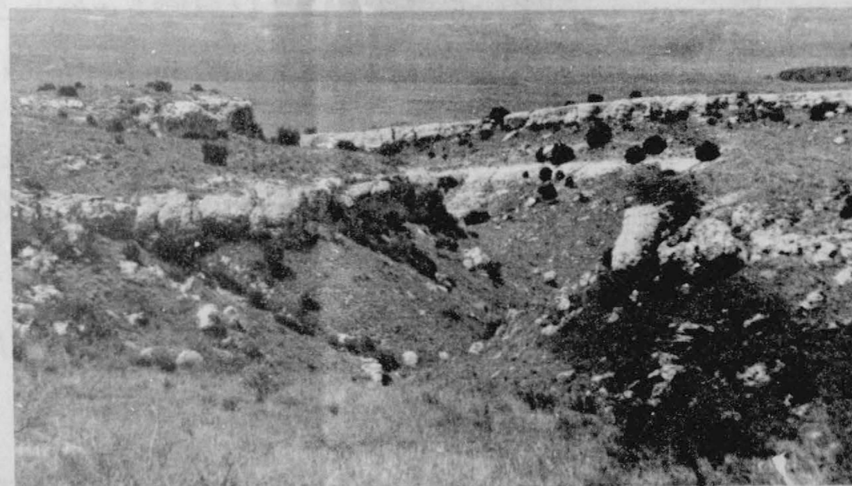
NATURAL SPILLWAY: The Palo Duro dam will have a natural spillway made of almost solid natural rock.