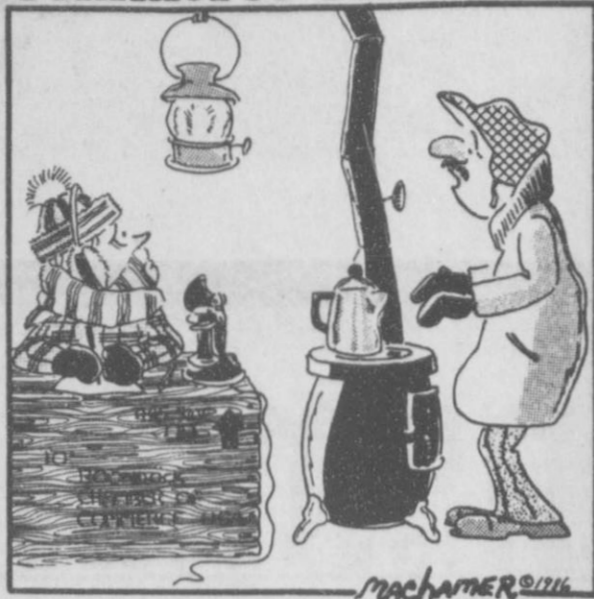
"Maybe you're right, Miss Beaver. Perhaps we should raise the membership dues."