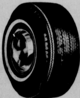
GOLD SEAL DUNLOP PROFILE

7.75-14-----$26.70 8.25-14-----$29.50 8.55-14-----$32.50