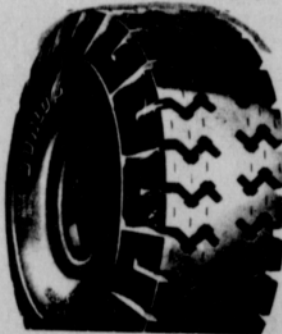
GOLD SEAL PLUS-BAR