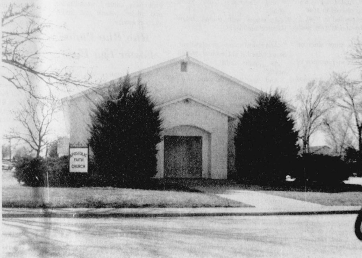
Apostolic Faith Church 824 S. Dressen

Morning Worship 11:00 Church Training 6:00 Evening Worship 7:00 Wednesday Service 7:00 659-5557 Intercessory Prayer Line 659-2911