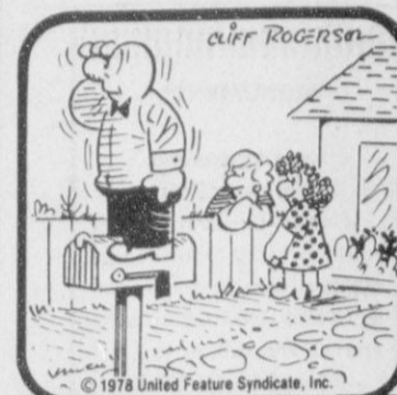
"THE MAILMAN'S LATE WITH HIS TV GUIDE!"