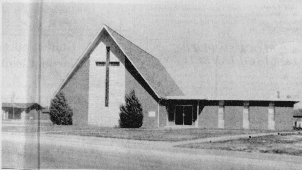
Faith Lutheran Church 1101 S. Bernice