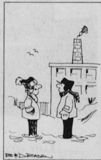
"I can't wait till I turn 70 so's I can run for president."