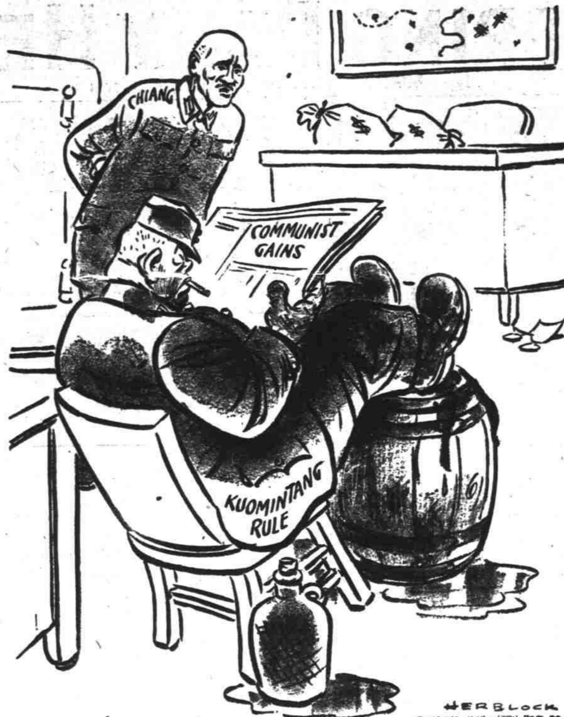
Washington Merry-Go-Round — Drew Pearson

"AS A LAST RESORT WE COULD TRY DECENT GOVERNMENT"