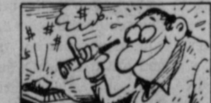
Some say that looking at sapphires strengthens the eyes.

The Postmaster explained that stamp collecting has become the world's most popular hobby, attracting more than 20 million collectors in the United States alone.