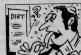
According to the U.S. Post Office, the glue on a stamp contains one-tenth of a calorie.

"Hope ever tells us tomorrow will be better." Tibullus