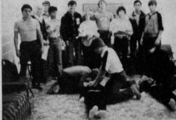
Shown above are high school students who have been taking a cardio pulmonary resuscitation course. There have been four different classes involving approximately 80 students given by the H & S EMS Service. The ambulance service hopefully will be able to get the CPR study in the school system as a permanent study. Students learned how to save lives of people in cardiac arrest and those of choking victims. Students took a written and performance test after the course.