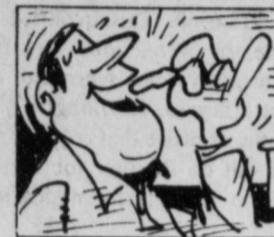
According to the U.S. Dept. of Agriculture, the average American eats 8 1/2 pounds of pickles a year.

"Self-control is at the root of all virtues." Samuel Smiles