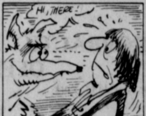
Some people have thought that seeing a wolf before the wolf saw them would render them speechless.

"It is the beautiful bird that gets caged." Chinese proverb