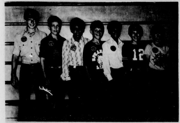
Fifth grade boys that received President's Physical Fitness Awards