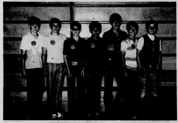
Sixth grade boys that received President's Physical Fitness Awards