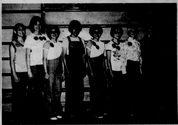
Sixth grade girls that received President's Physical Fitness Awards