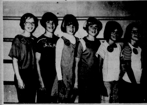
Fifth grade girls that received President's Physical Fitness Awards