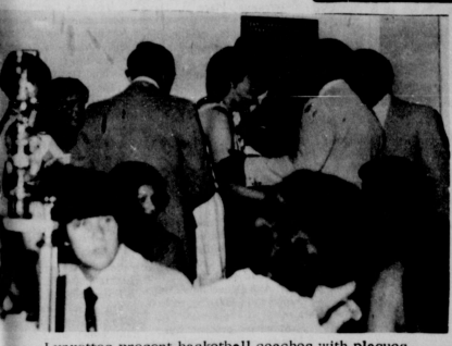
Lynxettes present basketball coaches with plaques As in every part of the nation, they have had to cope with seadily rising prices for goods and services. Their goods and services. Their beights, as a result. The bright side of the picture, however, is that their incomes went up at a faster rate than their costs, except during times of depression, leaving them with more discretionary cash to spend after taking care of their normal needs. In general, according to Bureau of Labor Statistics figures, it fastes close to $188.