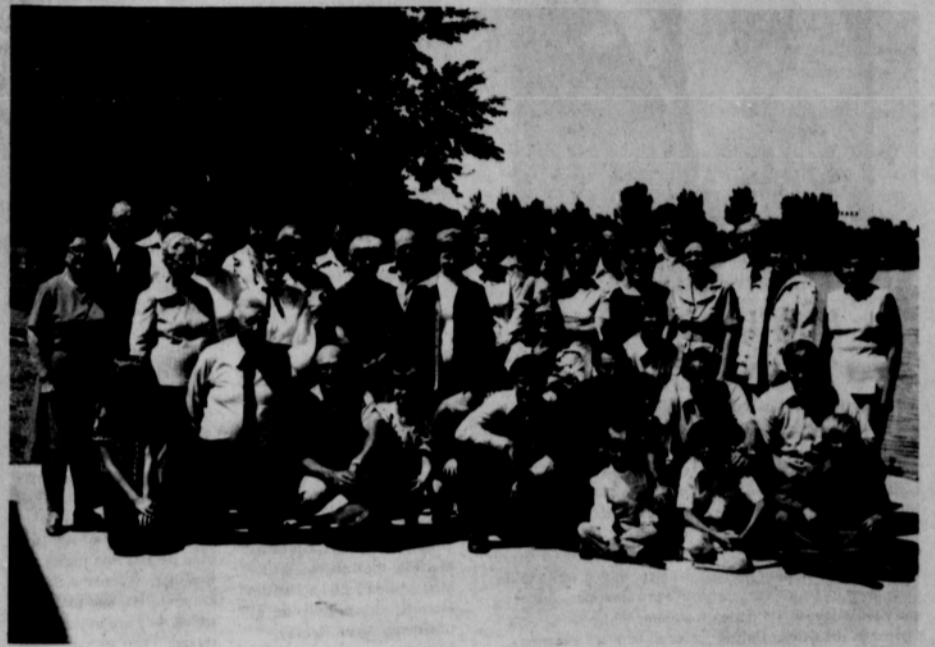
This picture was taken last year in Amarillo at the Panhandle Boat and Ski Club Building July 4, 1974.