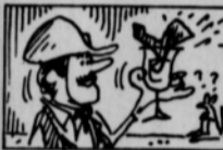
The Fitzroy Cocktail of the Australian "out back" consists of methylated spirits, ginger beer and one teaspoonful of boot polish!