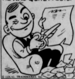
HE WAS QUITE A CUTUP

until he discovered Burton's could fit anyone's tastes and pocketbook when it comes to TV, Radio, Hi-Fi or Stereo. Their motto is "We Service What We Sell".