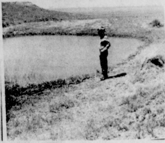
Recreation Potential On Private Lands

When most people in the Panhandle think of recreation they think in terms of a skiing trip to the mountains of Colorado or New Mexico; camping trips to one of the National Parks; or just a night out in a big city like Amarillo. Opportunity for recreation, however, is also available right here in Hansford County. Although commercial type recreation facilities are limited throughout the county, the establishment of private recreation developments is available to almost every landowner. Two areas of recreation which