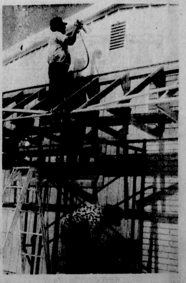
Summer heat doesn't slow the painters as they work on the remodeling of the Home Demonstration Building during the last week.

"They hope that each of you will plan to attend.