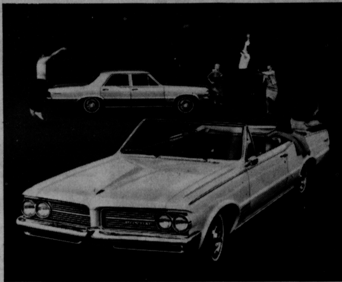
FOREGROUND: '64 TEMPEST CUSTOM CONVERTIBLE BACKGROUND: '64 TEMPEST 4-DOOR SEDAN

It's the '64 Wide-Track Pontiac Tempest with a new SIX for savers and a V-8 for swingers.