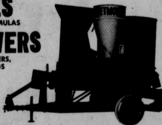
Here the Wetmore Grinder-Mixer has the Self-Feeder and Bottom-Unloader auger secured into position for moving. Auger is easily lowered into this position.

GRINDS HAY, GRAINS, SORGHUMS MIXES TO YOUR FORMULAS DELIVERS FEEDS TO FEEDERS, TANKS OR BAGS