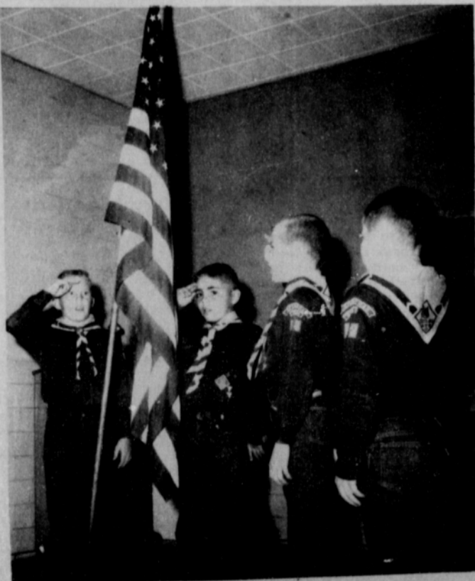
FLAG CEREMONY - Members of Cub Pack 78 led some 200 persons in the Pledge of Allegiance at the annual Blue and Gold banquet Thursday night in the junior high cafeteria.