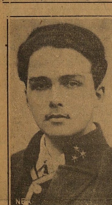
Possible restoration of the Austrian throne to youthful Archduke Otto (above) was rumored in dispatches from revolt-torn Vienna.