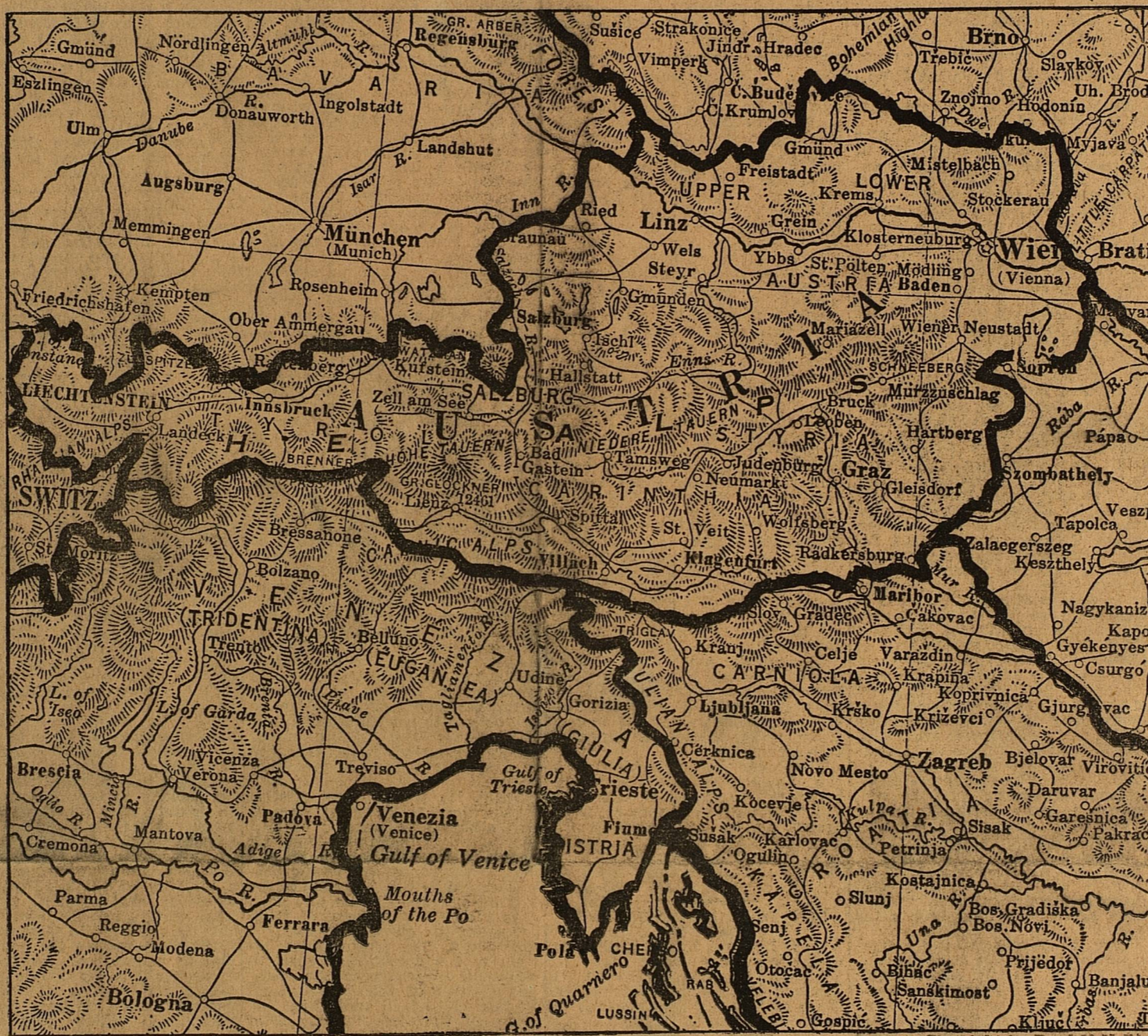
Where The Cauldron of Europe Boils Hottest

The compactness of Europe is one of the keys to understanding of the nervousness and a fear that sweeps over it every time there is a crisis. . . From London to Paris, for instance, is only 225 miles by air, which is comparable to the trip from New York to Washington, which is a matter of less than two hours by air, five hours by train. It is less than 50 miles from northern Italy to Germany, crossing Austria through the Brenner pass, and all Austria is only 250 miles long. And from Venice, Italian stronghold on the Adriatic, to Munich, South German hotbed of Nazism, is less than 400 miles on an air line, shorter than the trip from Chicago to Minneapolis. Fuel was added to the flames this morning with reports a rapid march into Austria and Germany might meet with accession to power of the Hohenzollerns and Hapsburgs.