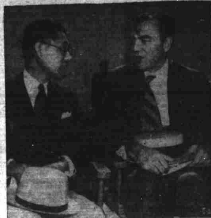
JAPAN'S DAY AT FAIR —The Hon. Kenseki Hori-nouchi (left), Japanese ambassador to U. S., was an honored guest at Japan Day at the New York world's fair, held on the weekend when Japan was apparently formulating a "Monroe Doctrine" for Asia. With the ambassador is Rep. Hamilton Fish, New York Republican, who discussed Far East situation with Japanese diplomat.