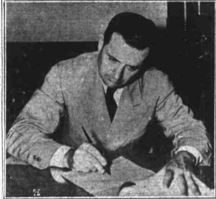
JAMES V. ALLRED