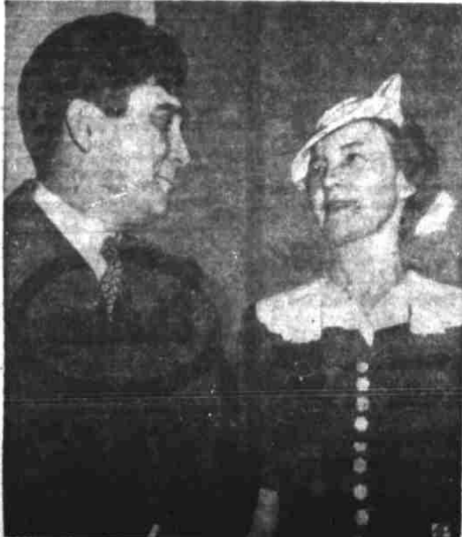
WHITE HOUSE HOPEFUL —Tough days of campaigning lie ahead of Wendell Willkie, Republican presidential nominee, shown with his wife as both began to plan for the big political battle. They have one son, live in New York.