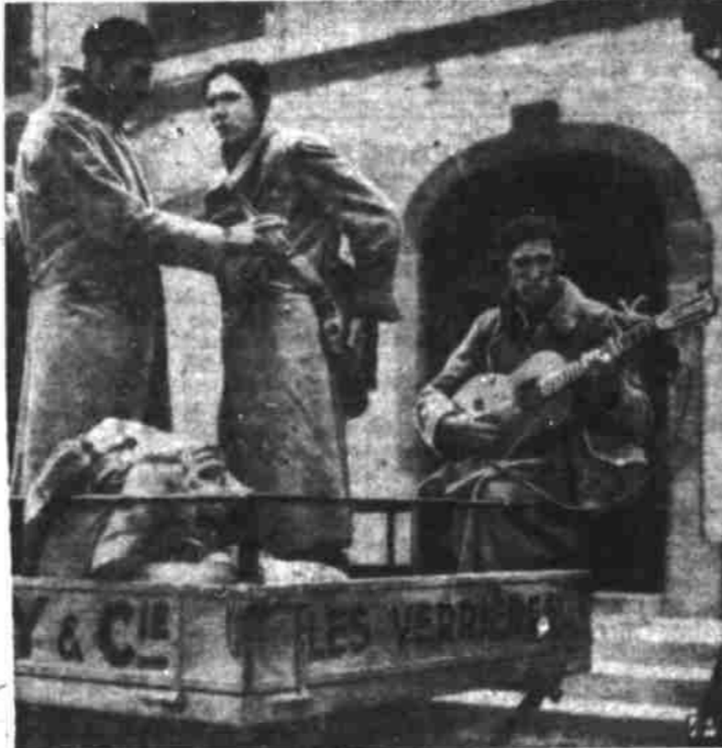
CHASIN' THE GLOOM —To cheer his comrades, this French soldier, surrendering to Swiss, kept his guitar, gave up rifle.