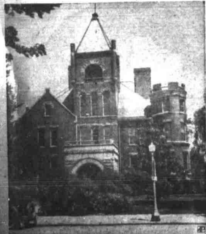
REPUBLICAN SHRINE —Here's the schoolhouse in Elwood, Ind., where Republican presidential nominee Wendell Willkie will formally accept the nomination. O.O.F. stalwarts point out that a sign over entrance reads "The hope of our country."