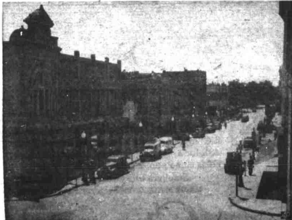
IT'S THE OLD HOME TOWN —Above sleepy street in Elwood, Ind., won't look anything like this on the day the town's now-famous son, Wendell Willkie, formally accepts the Republican presidential nomination. Elwood is Willkie's birthplace and here he grew up, figuring in countless boyish pranks that are fast becoming a rich part of Elwood folk lore.