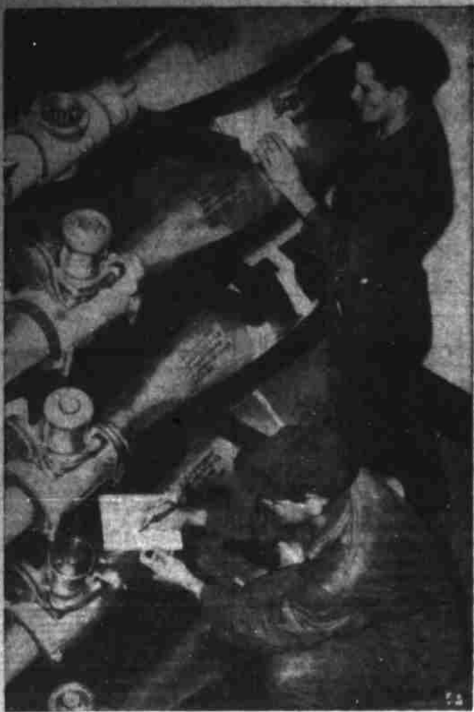
UNCLE SAM'S INVENTORY —Count and re-count is the rule at Randolph field in Texas—where armaments for U. S. are in training, where wheels and parts of all sorts are constantly in demand, to replace the worn-out ones. In the Randolph field storerooms these men count spare propellers. Identifying numbers and figures to indicate pitch of blade show on each "prop."