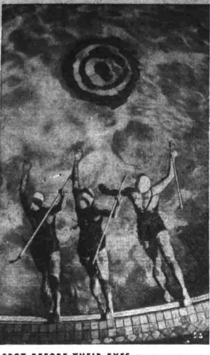
SPOT BEFORE THEIR EYES —You have to be good, to try harpooning a target, as these girls do at Long Beach, Cal.

NAVAL BASE BOMBED LONDON, July 8 (AP)—Barracks at Germany's great naval base of Wilhelmshaven were among the objectives bombed by British warplanes Sunday night, the air ministry announced tonight.