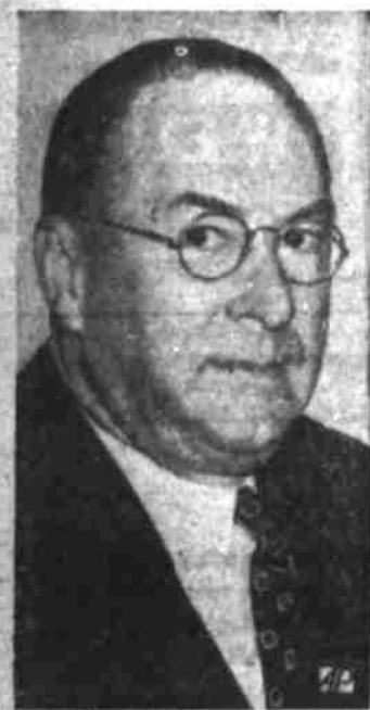
SHOPPING LIST —Job of supervising all defense purchasing has fallen to Donald M. Nelson (above). His appointment was a move toward speed-up of armament program.