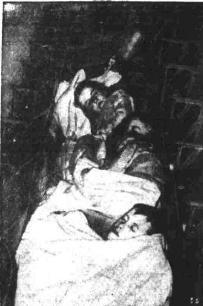
WAR—AND A FULL HOUSE —There was no room at the inn, so these war refugees piled their mattresses into the narrow aisles between seats of a London theater and slept there until they could find new homes somewhere in England. British caption describes this group as refugees driven from Low Countries by Nazi invasion.