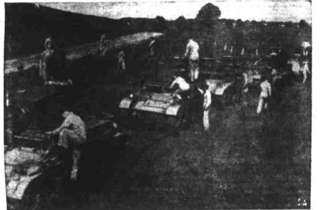
WEST POINT WAS NEVER LIKE THIS —Out of the classrooms came these West Point cadets, members of the graduating class, to man a unit of light tanks for war maneuvers at the Army's Aberdeen proving ground in Maryland. To get a real taste of combat, the future generals also worked out on several other weapons of modern warfare.