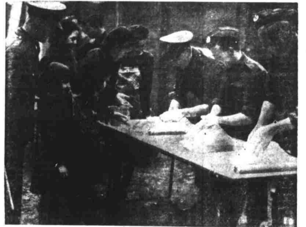
THE STAFF OF DEATH —French women from a nearby town were ready with help hints when British expeditionary force in France set up this cooking school near the front for sergeants and their crews. Lesson for the day, bread, and the idea is to bake it at least a little softer than a cannon ball—to eat, not to throw.