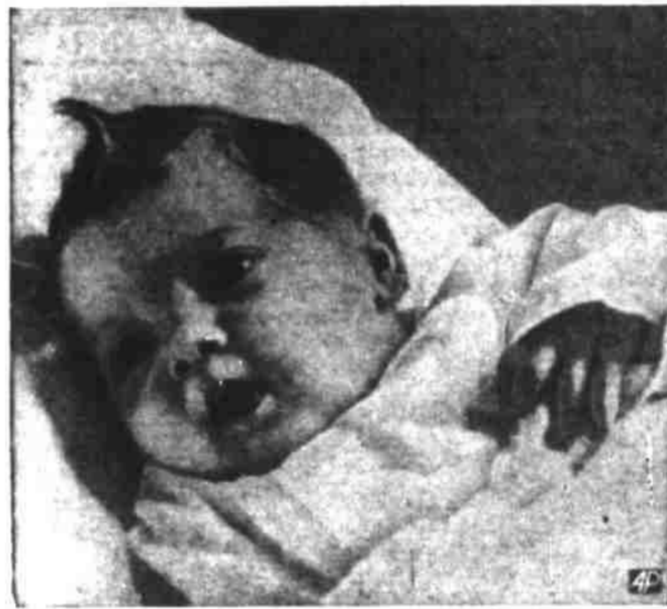
LITTLE QUEEN —No, she's just a princess, and a precious princess, too. Just a few days before she was born, Adolf Hitler invaded her native Denmark and turned the kingdom into a protectorate. She's Princess Margrethe, daughter of Crown Prince Frederik, was four weeks old when photographed on day she was christened in Copenhagen.