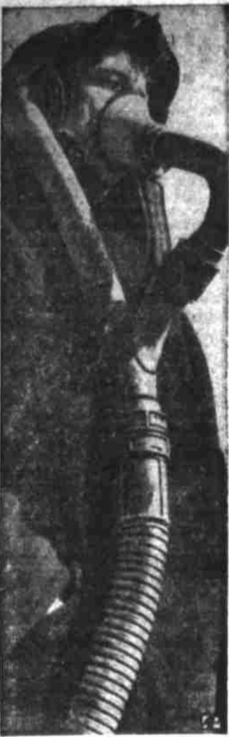
PIPELINE —No gas mask is in, only a talk tube through which the deck lookout shouts information and receives orders from gunnery officer of a British destroyer patrolling the English channel on watch for German invaders.