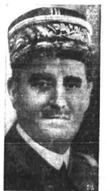
TRAPPED —Under command of French General Georges Blanchard (above), ill-starred Allied troops trapped in Flanders put up a "murderous battle" against Nazi mechanized columns rolling toward the English channel.