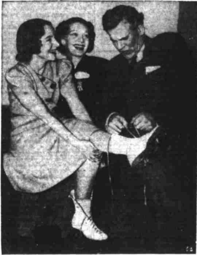
GOOD SKATES —Actor Walter Huston (right) handles a knotty problem for Actress Helen Hayes (left) at a roller skating party in New York for Allied Relief fund. Actress Gertrude Lawrence (center) waits her turn.