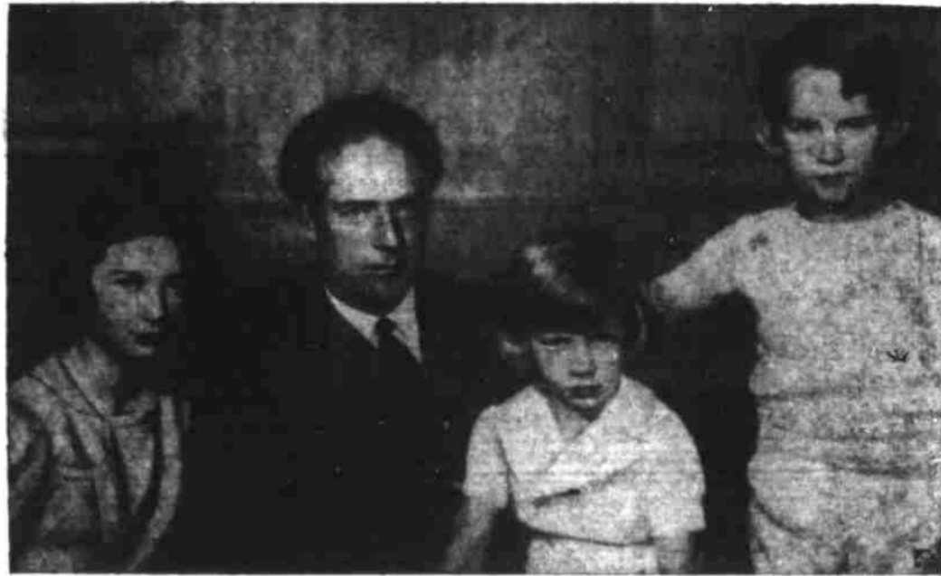
'UNEASY LIES THE HEAD' —Into separate hiding went young King Leopold and his three children after ordering his Belgian army to lay down arms and submit to German invaders to prevent further bloodshed and destruction. At left is Princess Charlotte, 13; right, Crown Prince Baudouin, 19. Prince Albert, 6, sits on his father's knee.