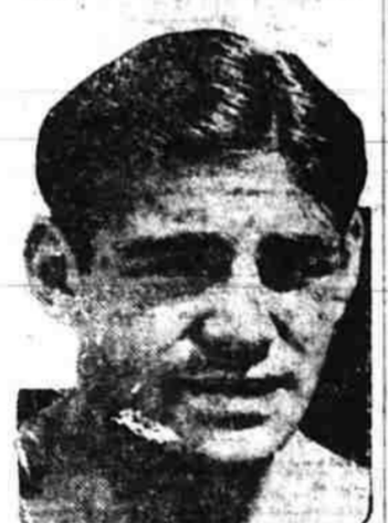
Sammy Mandell (above) will defend his lightweight title against Al Singer in New York City July 17.

Expert observers believe that Singer will meet the same fate. In a championship battle at Hartford, Conn., tonight, Bat Battalino, Hartford boy who holds his featherweight championship, will meet Ignacio Fernandez of the Philippines.