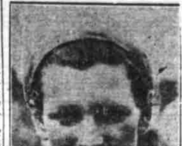
Mildred 'Babe' Diddrickson of Dallas, Tex., again proved she is a one-girl track team by winning five first places in tryouts for the American women's Olympic team.