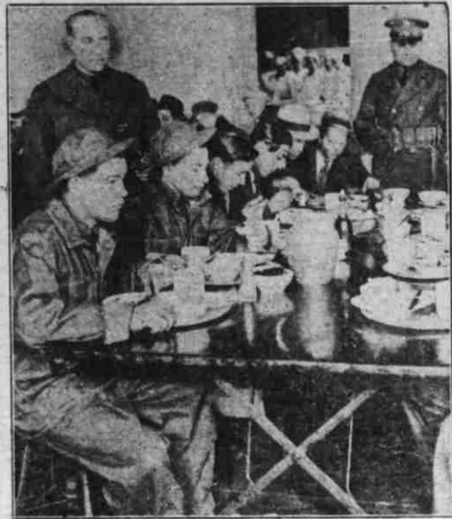
Some of the first contingent of men recruited into President Roosevelt's reforestation army are shown enjoying their first mess at Fort Slocum, New Rochelle, N. Y. They are wearing the special uniforms in which they will work in national forests.