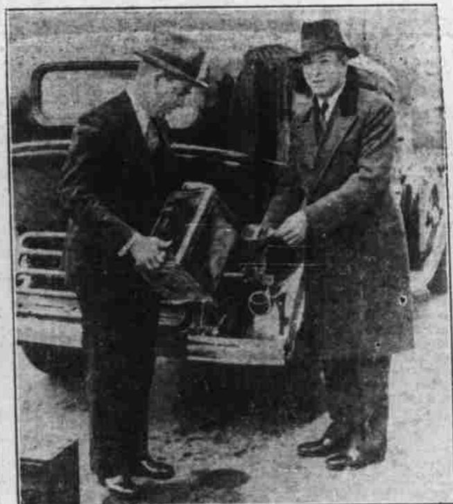
Secretary Henry Wallace (left) of the agriculture department is shown pouring into his official car some of the gasoline made from farm products alcohol. Rep. Dirksen of Illinois, author of one of four house of representatives bills concerning this gasoline, is at the right.