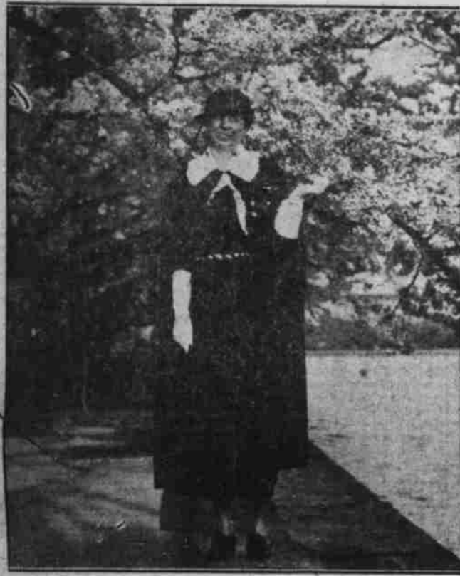
Lured outdoors by balmy weather, Mrs. Roosevelt strolled along the tidal basin and obliged cameramen when they asked her to pose before Washington's famous Japanese cherry blossoms.