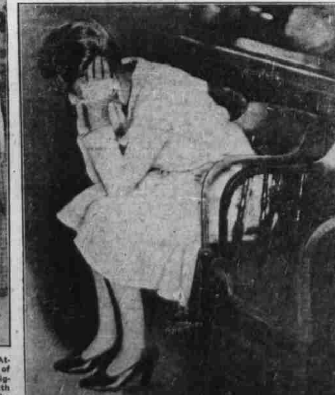
Winnie Ruth Judd is shown with her hands clasped about her head as she gave way to one of several hysterical outbursts during the hearing at Florence, Ariz., to determine her sanity.