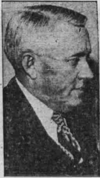
According to reports from well informed circles the administration has decided upon Guy T. Halvering, a former representative from Kansas, for commissioner of internal revenue.