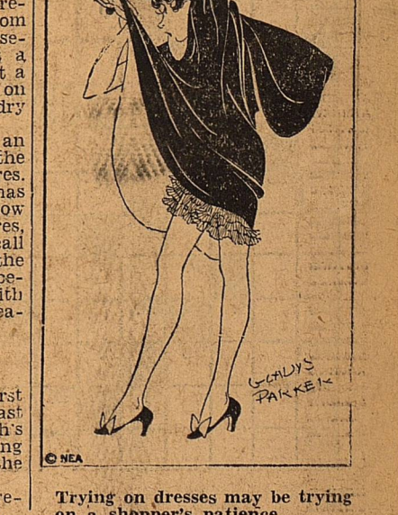
Trying on dresses may be trying on a shopper's patience.