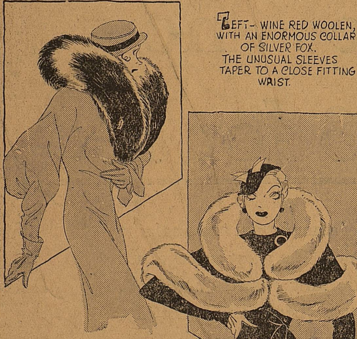
LEFT - WINE RED WOOLEN, WITH AN ENORMOUS COLLAR OF SILVER FOX. THE UNUSUAL SLEEVES TAPER TO A CLOSE FITTING WAIST.