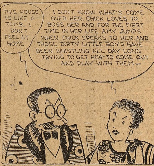
It's Hard to Believe