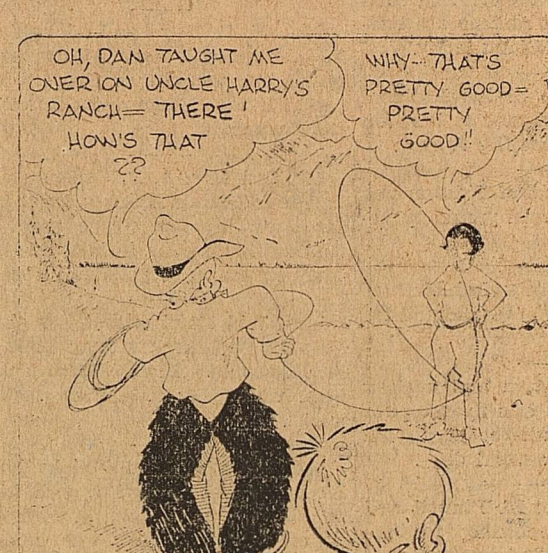
Beat That If You Can