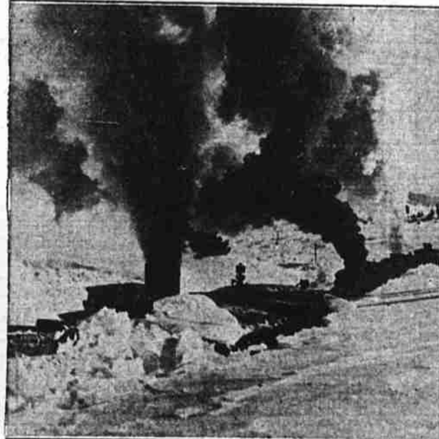
A powerful rotary snow plow, pushed by three locomotives, is shown bucking 20-foot drifts to go to the rescue of passenger trains marooned by a blizzard in the Rockies of Colorado. Passengers of the marooned trains lived on turkey stew made with water from snow and an average shipment of turkeys.