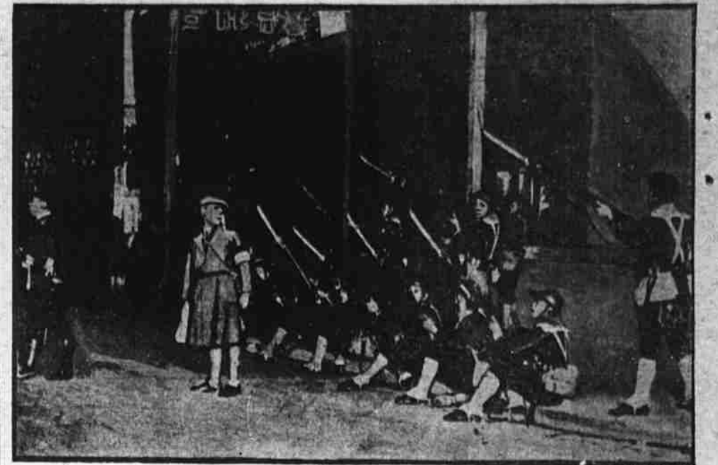
Street scenes such as this have been common in and around Shanghai as Japan landed troops to battle the city's Chinese defenders. This detachment of Japanese bluejackets, with bayoneted guns much in evidence, was part of the force operating along the north Szechuan road, scene of some of the most spirited resistance by Chinese.