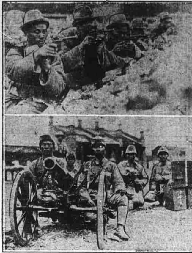
These exclusive Associated Press photos, taken shortly before the outbreak of the current warfare in Shanghai, show Chinese troops in training for expected trouble. Above is a closeup of soldiers holding pistol drill in trenches, and below infantrymen are shown at cannon practice.