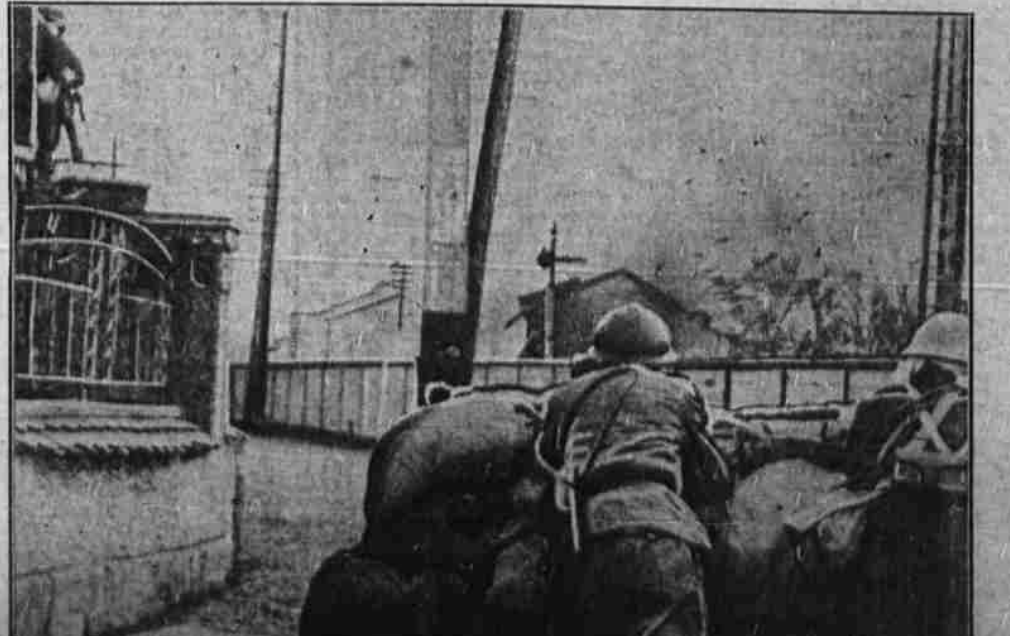
Meeting unexpected resistance from the Chinese forces the soldiers from Tokyo had to call upon all their resources to hold their own in the bitter fighting around Shanghai's Chapei district. Here's a Japanese machine gun nest on the front line. Beyond may be seen the smoke of the battle as Chapei was turned over again and again with shot and shell.