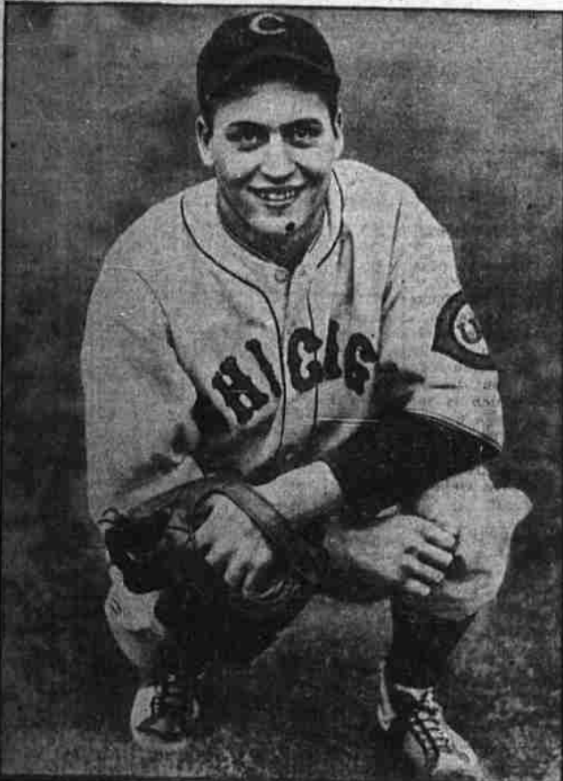
Billy Herman, who came up to the Chicago Cubs from Louisville last summer to bat .327 in 25 games and field satisfactorily, is out to clinch the second base job this year. Peculiarly enough, Manager Rogers Hornsby, quite a second baseman himself, hopes Billy can handle it alone, for Hornsby has other things to attend to.