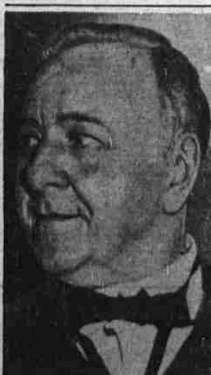
Recent portrait of Josephus Daniels of Raleigh, N. C., secretary of navy in President Wilson's cabinet.