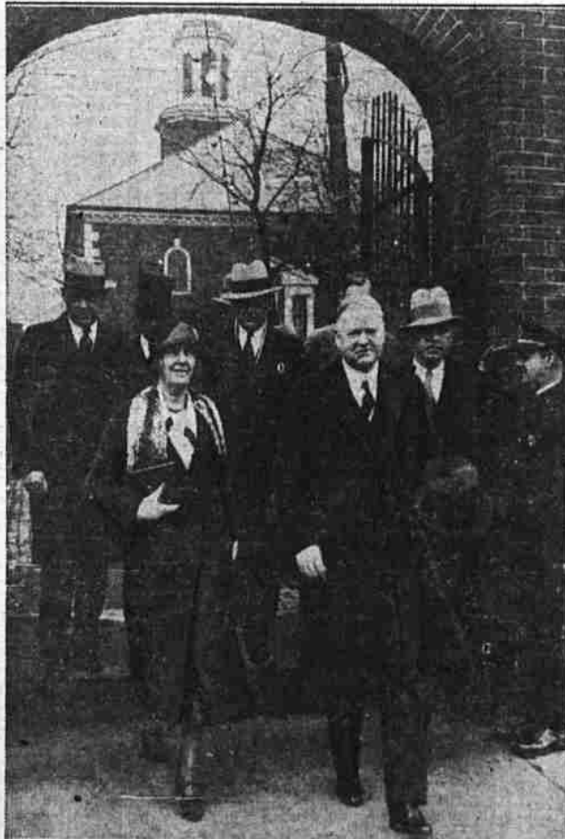
President and Mrs. Hoover as they left Christ Church, Alexandria, Va., after attending George Washington memorial services. They occupied the pew which was used many years by George Washington and members of his household.