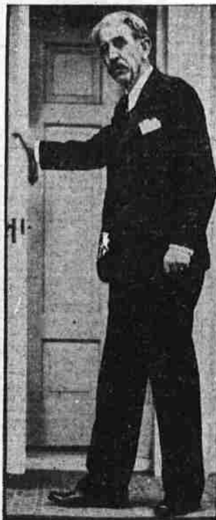
Gov. William H. "Alfalfa Bill" Murray of Oklahoma is shown at the door of his gubernatorial residence in Oklahoma City just after a "tea party" for newspapermen at which he announced his candidacy for the democratic presidential nomination.