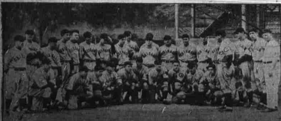
There are a few old-timers in this gathering of prospective Chicago Cubs for the coming baseball season, but most of them are rookies listening intently as Manager Rogers Hornsby (fourth from right) tells the boys what he expects of them this year.