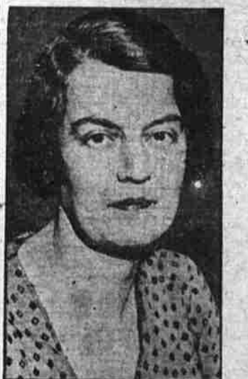
Grand Duchess Marie, Russian emigre, is shown shortly before sailing for London to attend the wedding of her son, Prince Lennart of Sweden, to a Swedish commoner. She has been divorced from Prince William of Sweden since 1913.