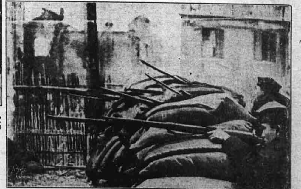
This typical battle scene from Shanghai shows Japanese marines firing from behind a sandbag barricade during the intense fighting in Shanghai's Chapei district. In the background may be seen wreckage of buildings destroyed during the bombardment.