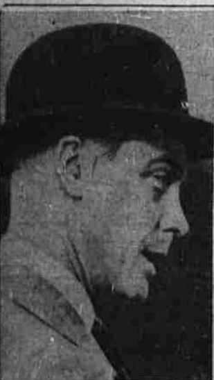
A recent picture of the Prince of Wales, heir to the British throne.