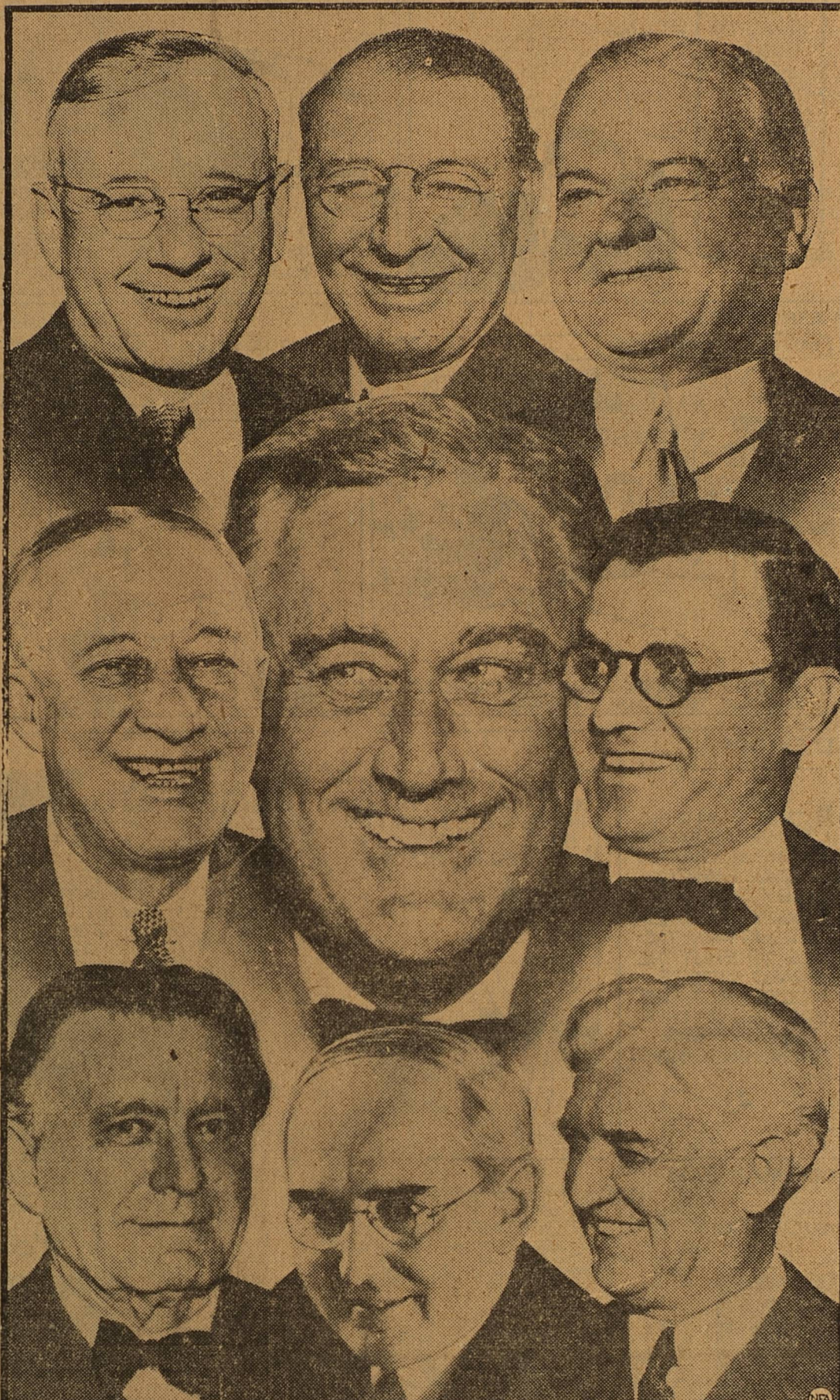
They're saying that this year's presidential race will produce one of the dirtiest campaigns in U. S. political history, but you'd never guess it from the affable smiles of these nine leading combatants in the fray. For campaigns, dull or dirty, call for beaming smiles as well as "fighting faces," and here, in friendliest mood, you see, left to right: Top row, Gov. Alfred M. Landon, Frank G. Knox, Herbert Hoover; middle row: Alfred E. Smith, President Roosevelt, Gov. Eugene Talmadge; lower row: Senator William E. Borah, Senator Arthur H. Vandenberg, Senator Lester J. Dickinson.