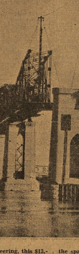
A marvel of engineering, this $13,000,000 bridge over the Mississippi river, two miles above New Orleans, will be completed by November, saving long delay now encountered in ferry service. Unusual feature is that while the main structure of the span is only .57 mile in length, it approaches from east and west respectively are 1.92 and 2.19 miles. This provides an easy grade for trains of 1.25 per cent and for vehicles of 4 per cent to reach a span high enough for ocean ves-