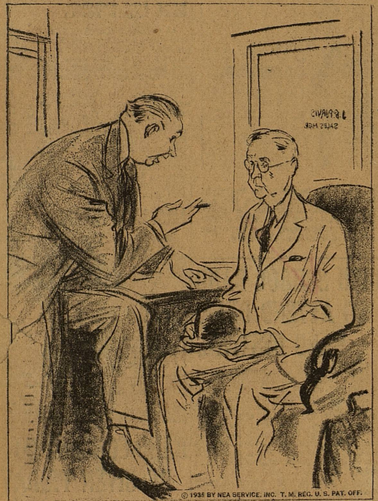
"Slap 'em on the back—tell 'em jokes. That's the way to make sales."