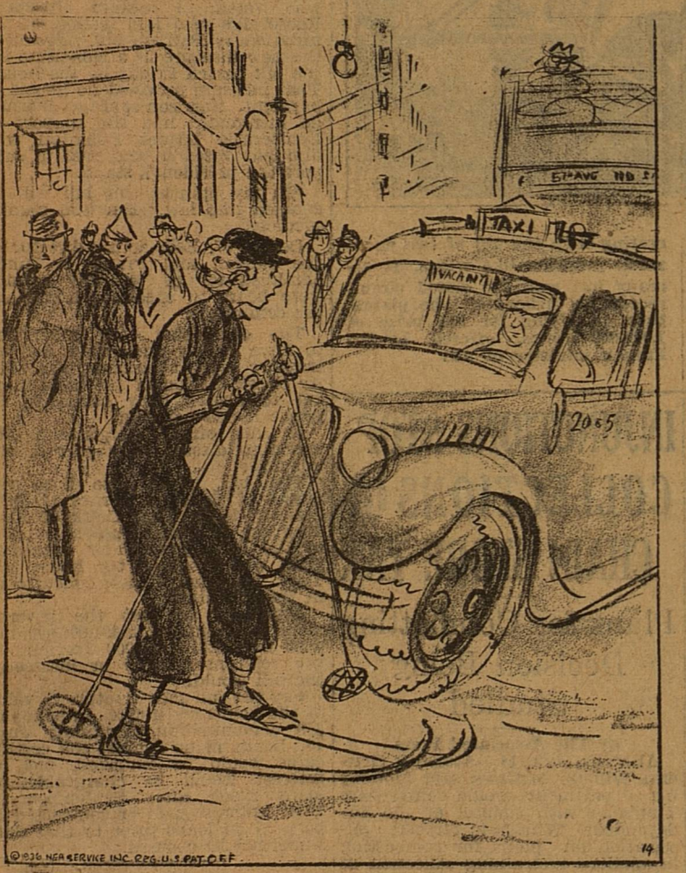
"Say—where do you think you're going?"