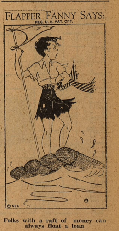
Folks with a raft of money can always float a loan