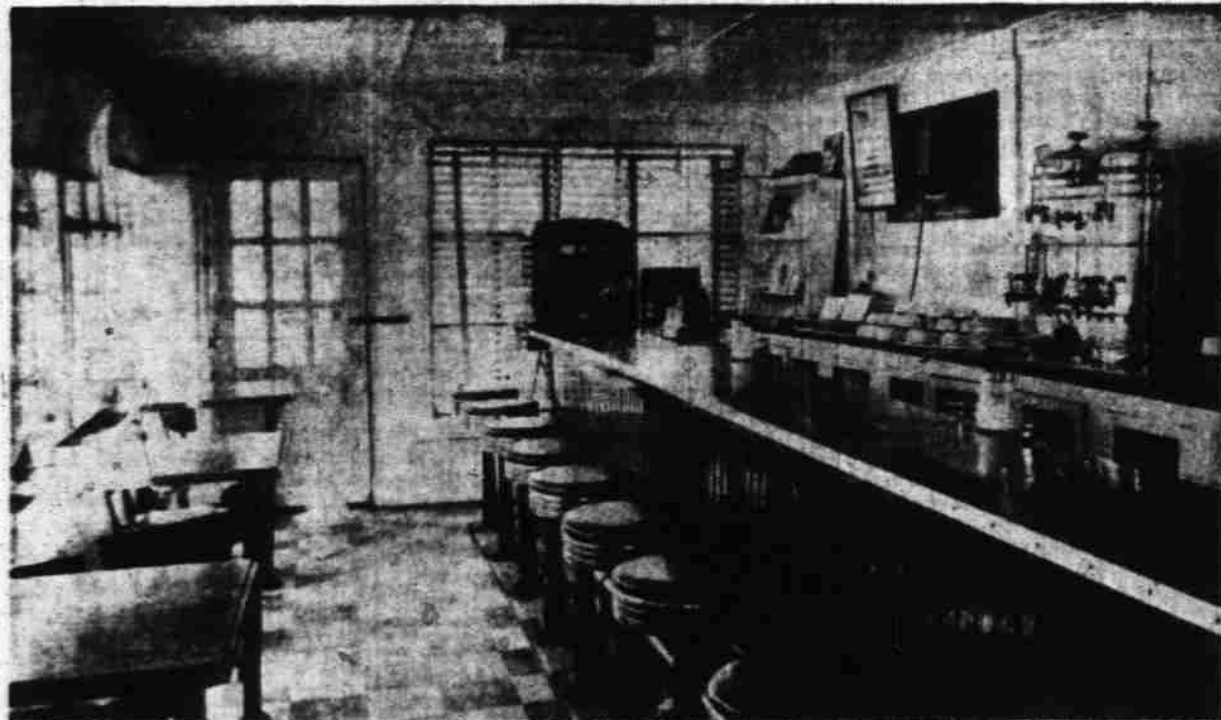
HONEY EFFICIENCY —The home-like atmosphere and the compact arrangement which leads to efficient service have combined with tasty food at economical prices to make the Postoffice Cafe one of the most popular eating places in Big Spring. The large number of patrons who consistently make the Postoffice Cafe a first choice argues well for its friendly and quality service.