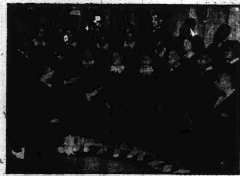
FAMOUS SINGERS—The Wings over Jordan chorus, to be presented here Wednesday evening at the city auditorium, is recognized as one of the outstanding choral groups of this day. It recently returned from Europe where it was held an additional four months by request after completing its intended tour before troops in Italy.

Millions prefer three points in St. Joseph Aspirin: (1) High quality (2) Fast action (3) Real economy. Always demand St. Joseph Aspirin, world's largest seller at 10c. Save more on 100 tablet size for 35c.