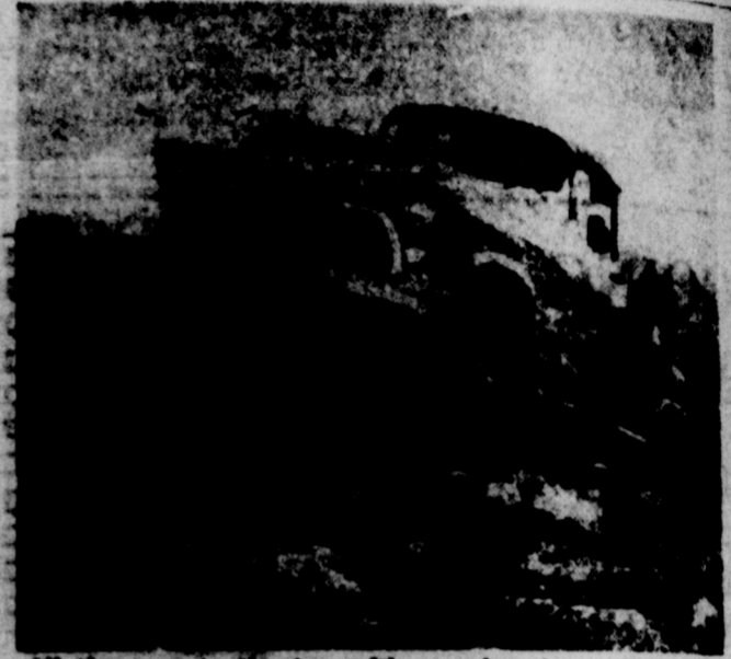
All the way to the top without using the road! Here the truck scales high boulder pile near the 14,110-foot summit.