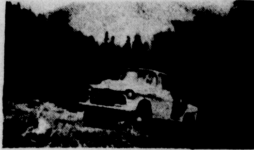
Steep grade near timberline—a rugged test of power. The power and torque of Chevrolet's famous Thriftmaster 6 proved more than a match for the most difficult grades.