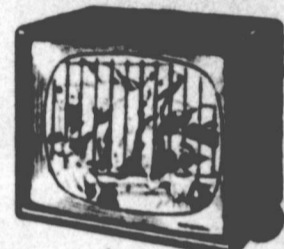
The Slender, budget-priced table TV 262 sq. in. viewable area. "One-Touch" on-off control. Every nubbin, knob, or line is ground finished, extra! 211870 Series.