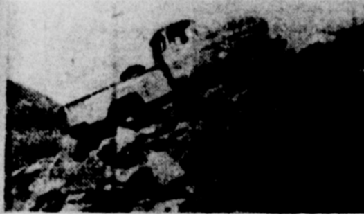
Miles of loose boulders and thinning air offer extreme challenge. Yet the big Chevy engine never faltered; it performed flawlessly mile after mile, all the way up the mountain!