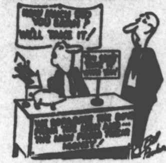
"The Bureau of Internal Revenue frowns on this sort of frivolity, Hawkins!"