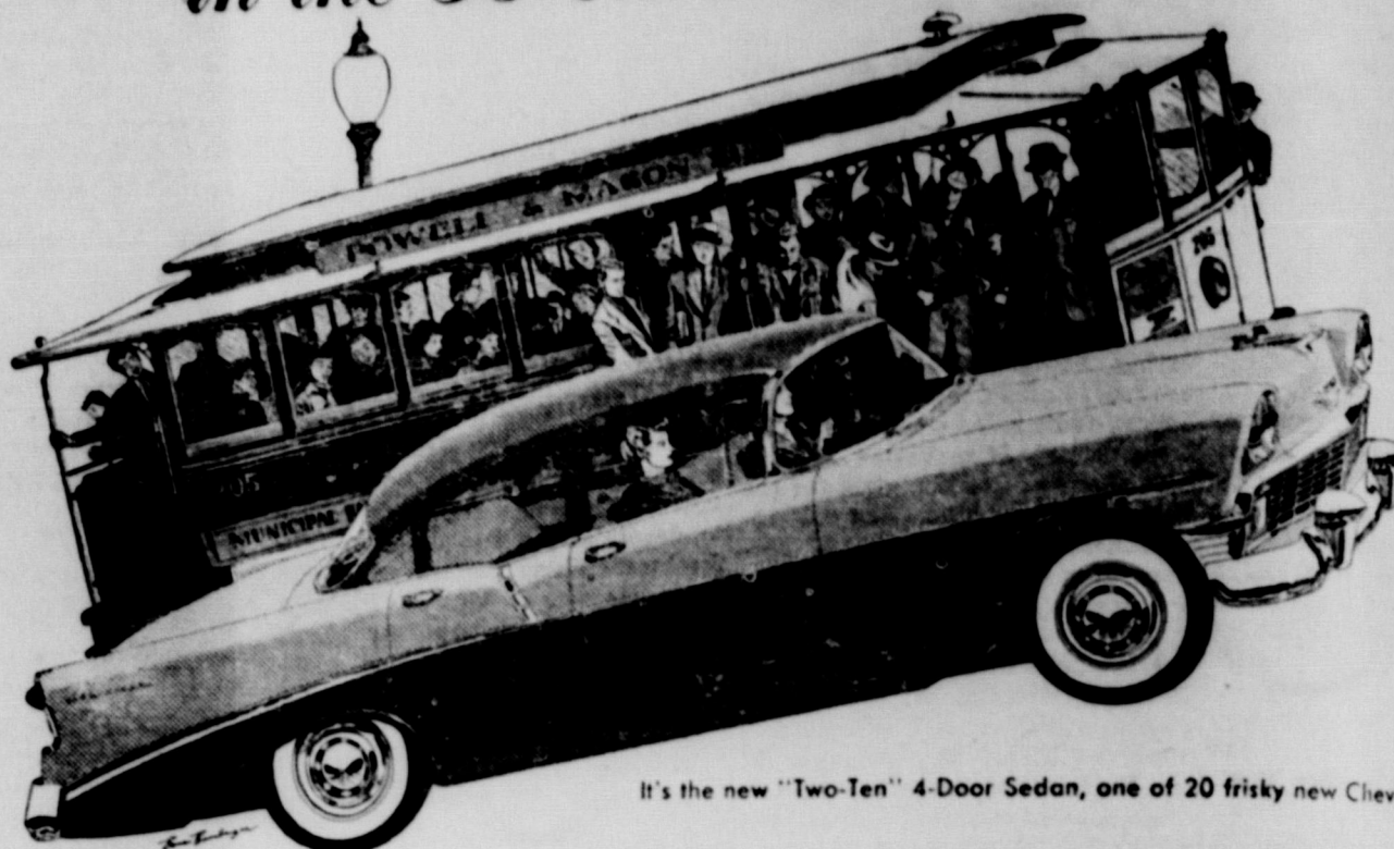
It's the new "Two-Ten" 4-Door Sedan, one of 20 frisky new Chevrolets.

This beauty's got power that's panther-quick and silk-smooth. Power that puts new kick in your driving and makes passing far safer.