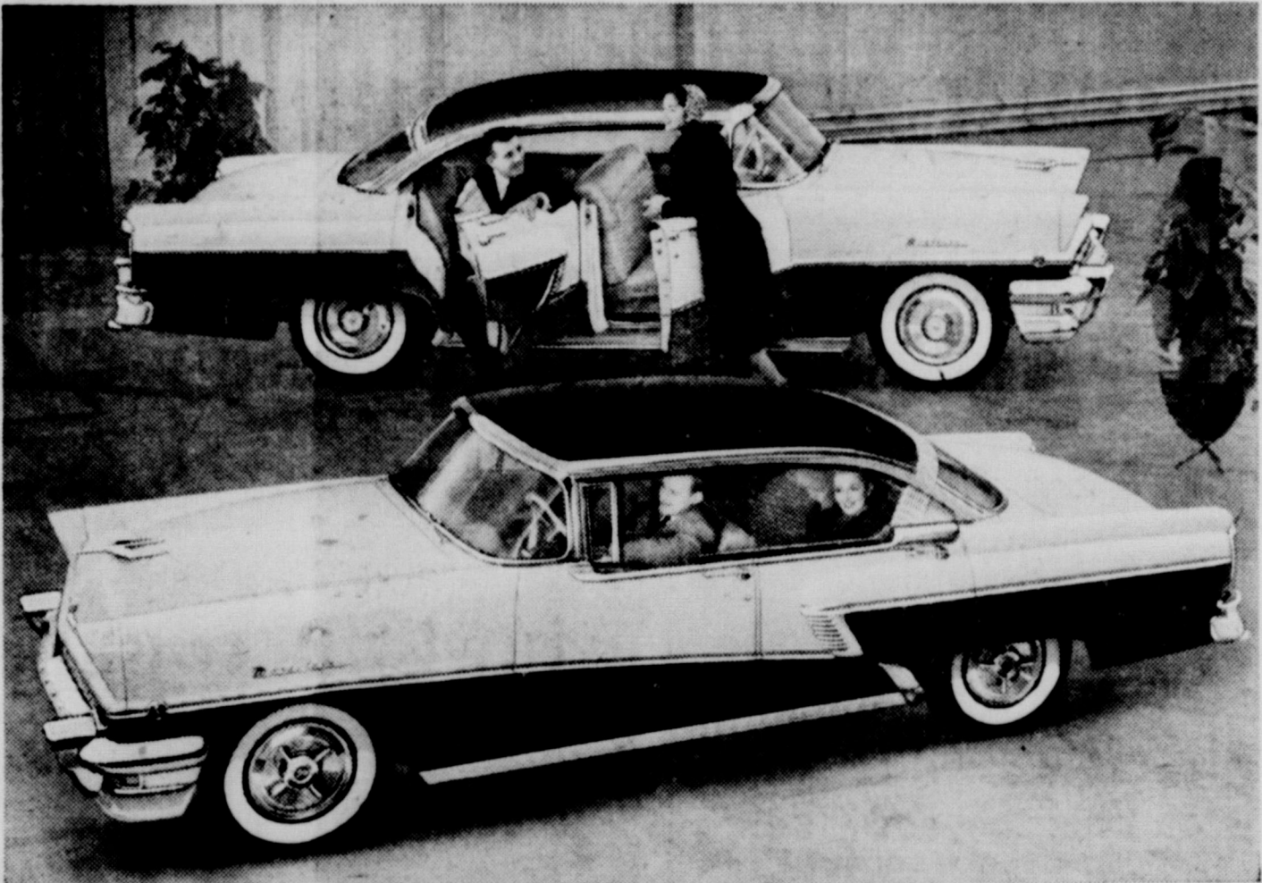
THE NEW MONTCLAIR AND MONTEREY PHAETONS—No center pillars, of course. But more important, no view-cramping curve of the roof—only the whole wide world to see.

Newest, most advanced design in 4-door hardtops. Available in Montclair, Monterey, or Custom series.