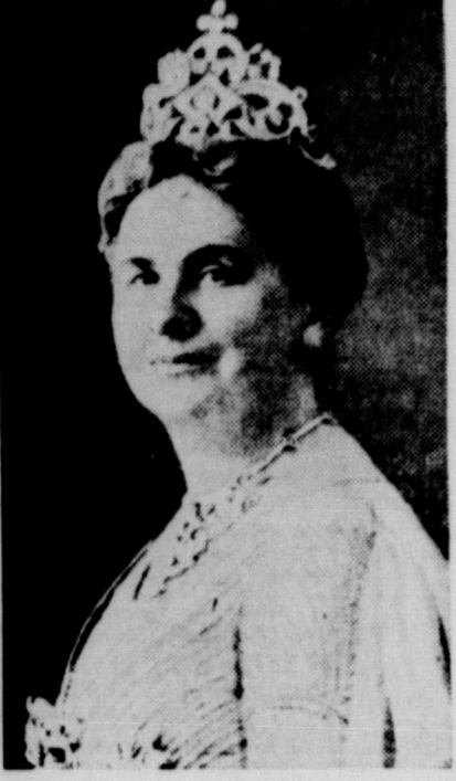
Rulers of the three nations recently invaded by the war juggernaut of Germany are, left to right: The Grand Duchess Charlotte of Luxembourg, King Leopold of Belgium, and Queen Wilhelmina of The Netherlands. Control of these nations would give Germany the advantage of air bases much closer to England.