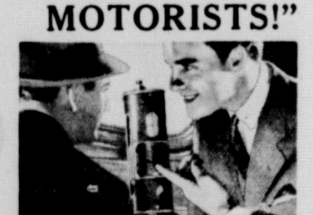
Dodge economy with this free "Gasometer' test which shows exactly how many miles