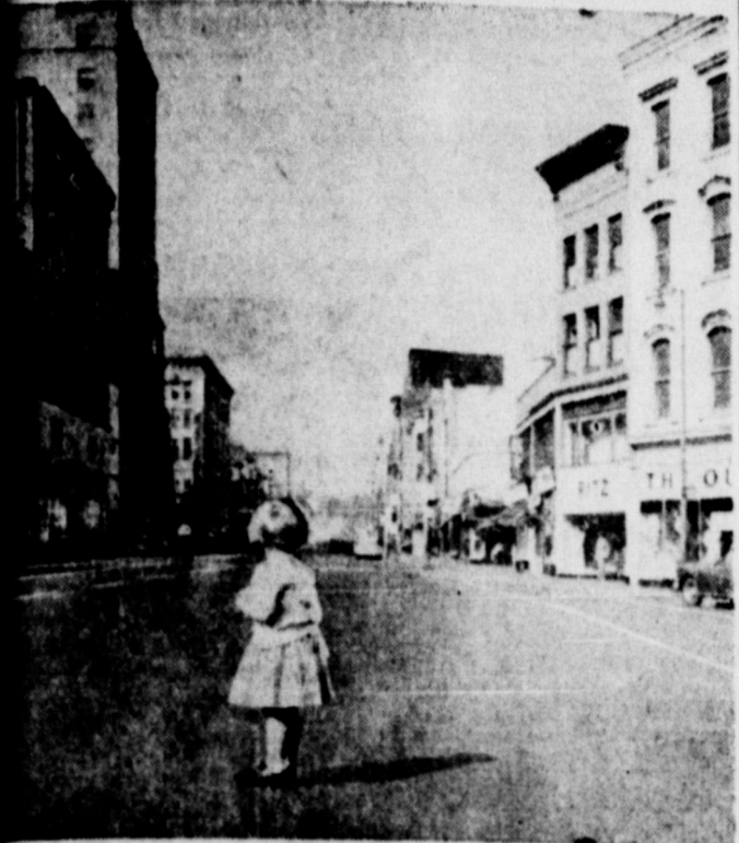
DEAD . . . Bonny Coby, 2, appears to be stranded as she stands a deserted street in Utica, N. Y., during simulated atom bomb. The city was described as devastated with casualties heavy in sck. Many residents failed to take cover and were described as dead." Make-believe enemy planes roared over the city and the "atom bomb" 13 minutes before the red alert was sounded is industrial heart.