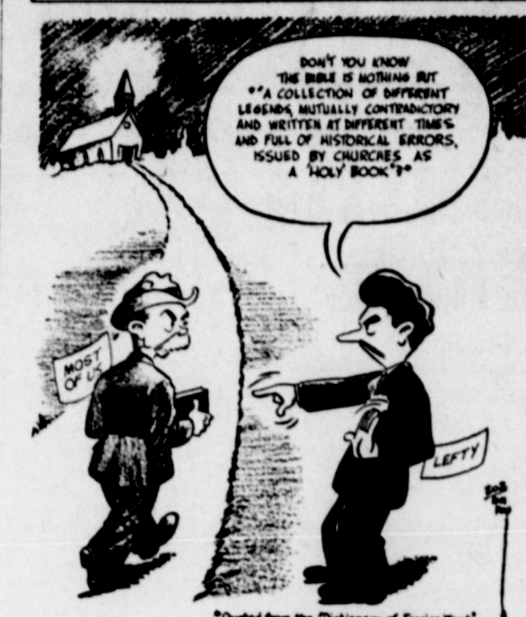
"The Fool Hath Said In His Heart, There Is No God" Psalms 53:1