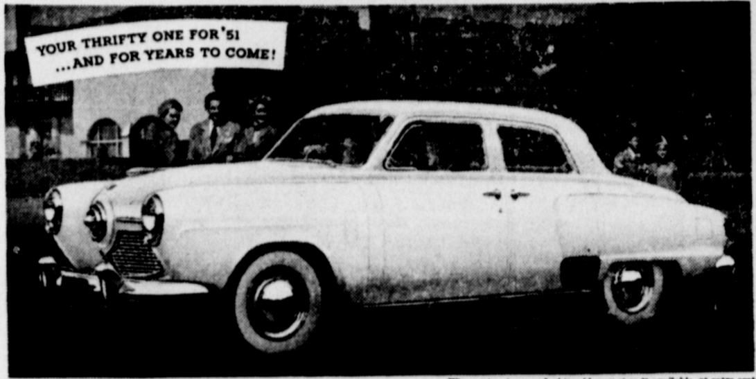
Wheel trim rings, and white sidewall tires available, at extra cost.